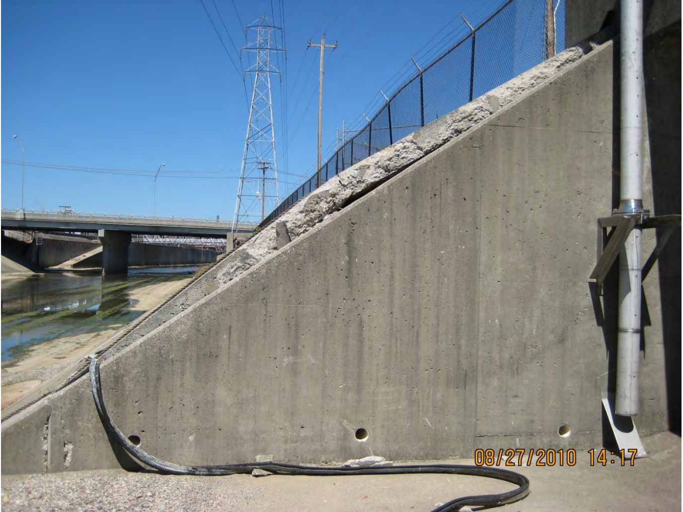
Wall Failure in Section 4A due to failure of a corrugated metal pipe