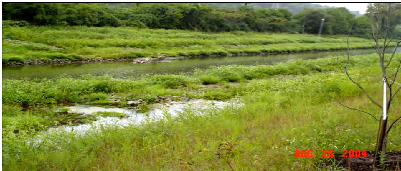
Channel Work completed in Section 3 in 2004 using bio-engineering techniques

Project Description: The authorized flood damage reduction project includes 17.5 miles of channel improvement, 2 miles of levees, 3 pumping plants, modification of highway and railroad bridges, and the addition of 2 pumping units at the existing Mill Creek barrier dam. Remedial repairs need to be performed at previously completed sections 1, 2, and 4A in order to turn these sections over to the Non-Federal Sponsor for operation and maintenance.