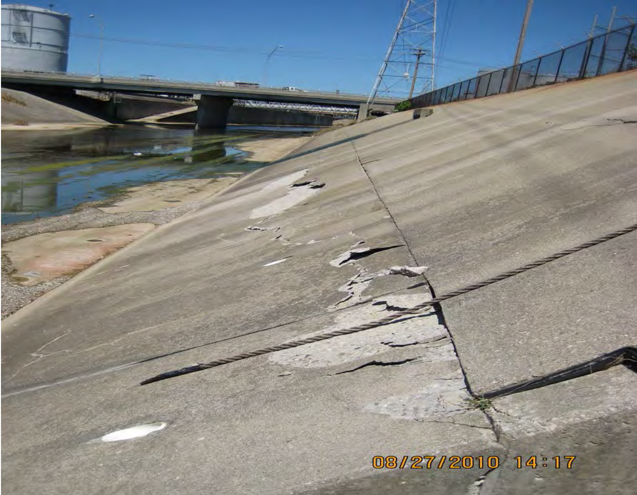
Wall Failure in Section 4A due to failure of a corrugated metal pipe

Construction on the Section 3 Punch List/ Maintenance Work Contract was awarded in February 2003 and completed in May 2004. Section 3 was turned over to the Non-Federal Sponsor for Operation and Maintenance in October 2004. The Flood Warning System (FWS) was approved in December 2003 at 100% federal funding. The installation of the FWS was completed in September 2004.