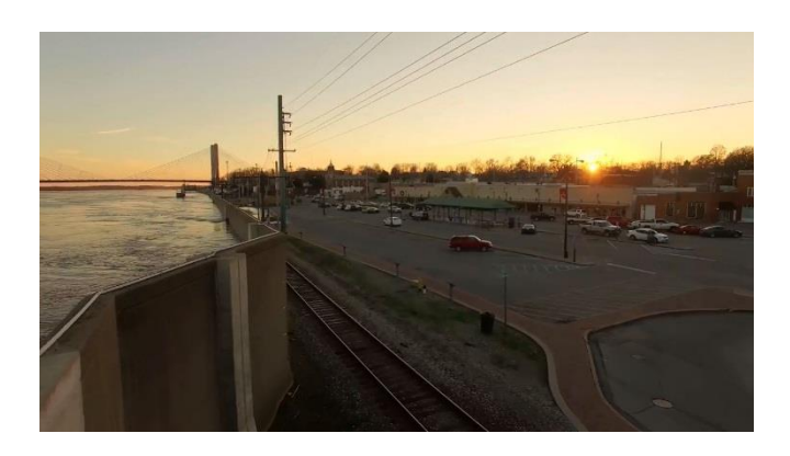
Cape Girardeau Floodwall

commercial, and transportation development would be affected by failure of the system.