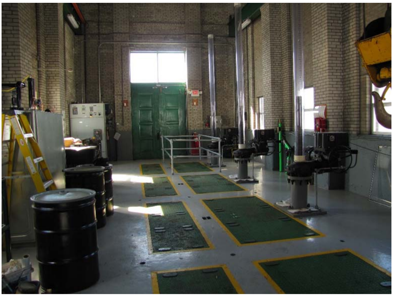
Informational Photo Number 1