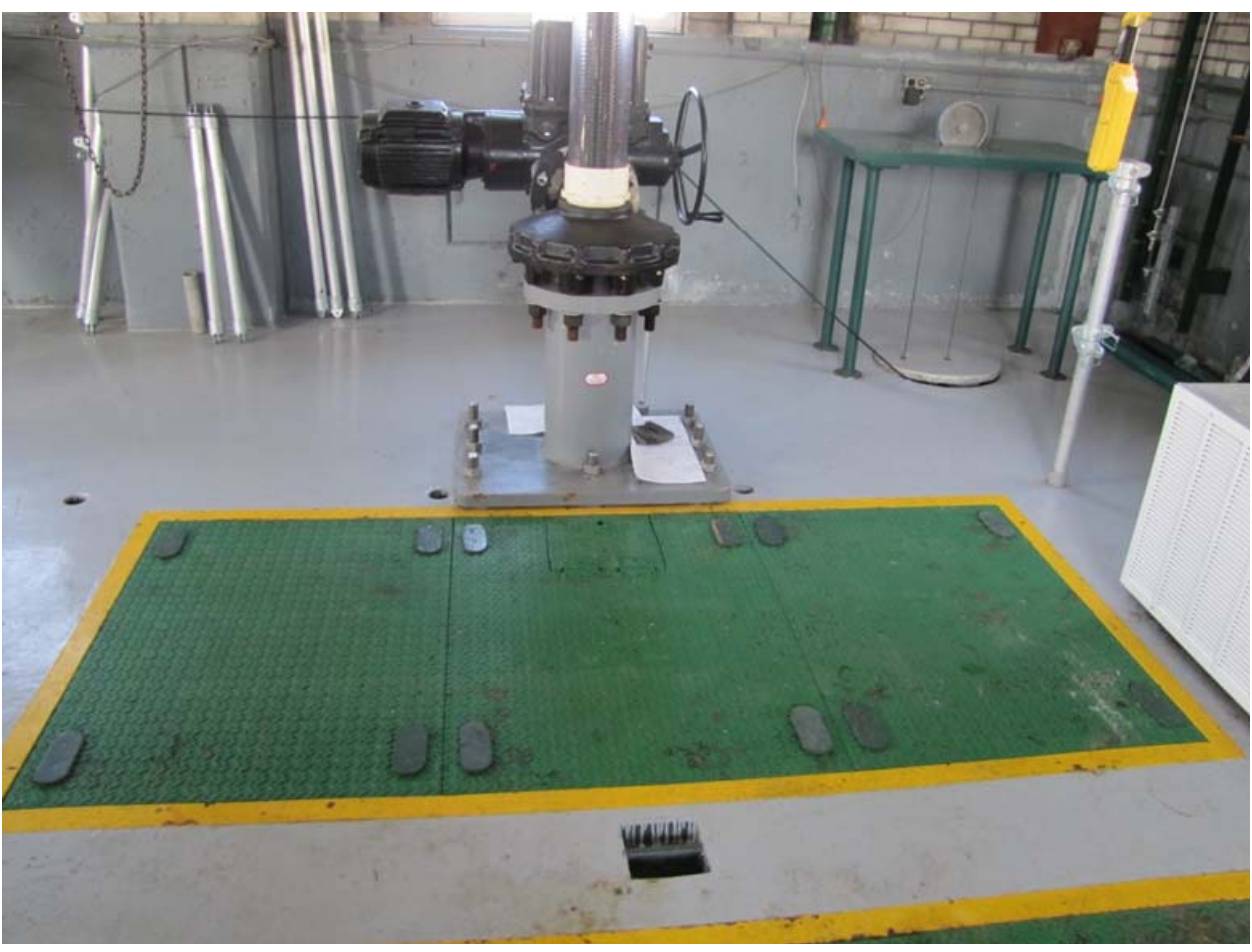
Informational Photo Number 2