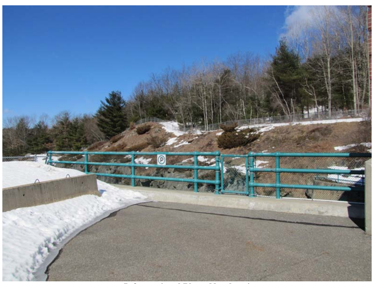
Informational Photo Number 4