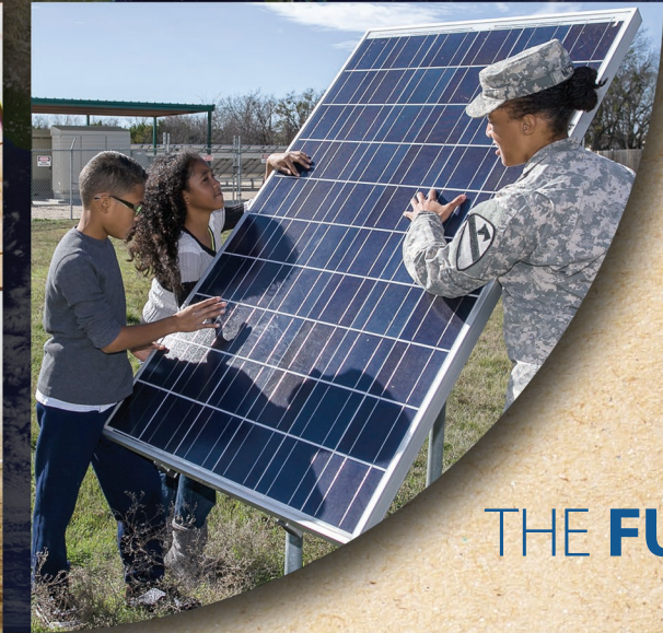
CHART THE FUTURE