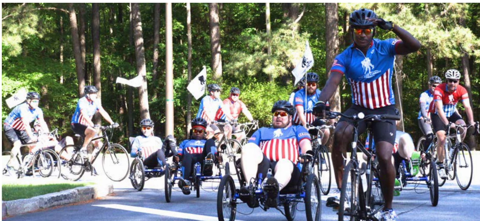
The Wounded Warrior Project offers bike rides to help Service members overcome physical, mental, or emotional wounds.

Veterans Service Organizations like Wounded Warrior Project can help. WWP helps veterans in their