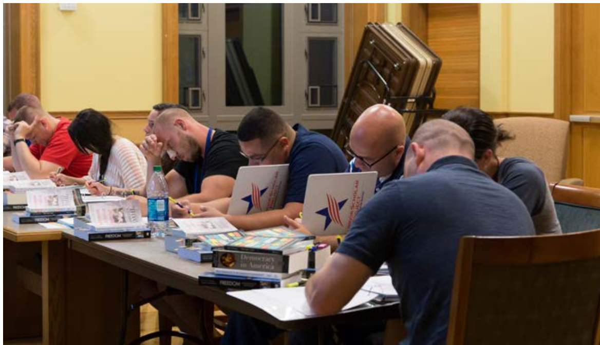
Enlisted Service members who are now Veterans attend a free boot camp to develop the skills to complete a four-year undergraduate program.

The key to becoming a successful learner in a rigorous baccalau-