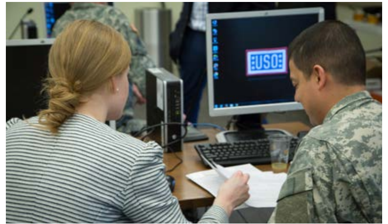
Soldier receives resume assistance from USO/Hire Heroes staff.

Military families who are within one year of their separation from the military and have previously taken part in a USO program or service are also eligible for USO