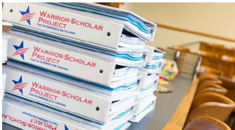
Warrior-Scholars learn how to frame and develop their ideas in an academic context, think critically, and formulate an argument.