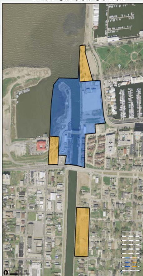
17th Street Canal