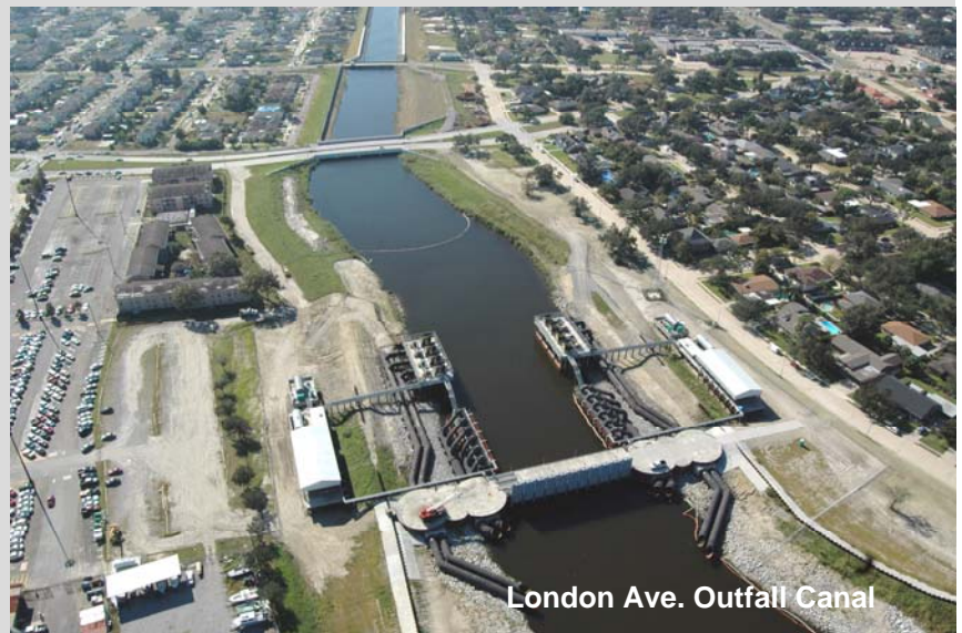
London Ave. Outfall Canal