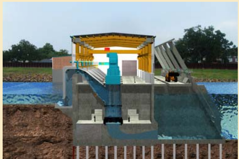
Above: Cutaway illustration of closure structure and pump station building. Left: Proposed locations of permanent surge gates and pump stations at the three outfall canals. Illustrations: PCCP Constructors JV