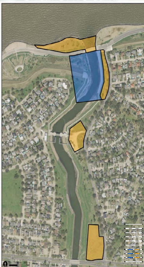
Orleans Ave Canal