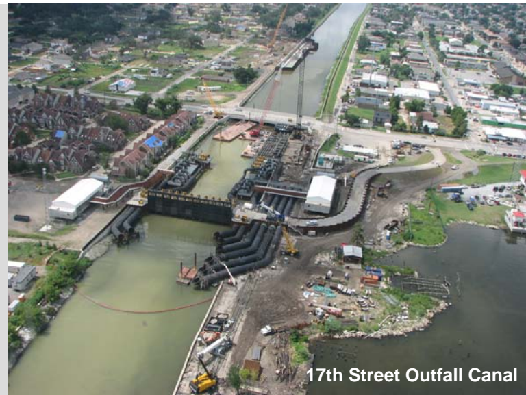
17th Street Outfall Canal