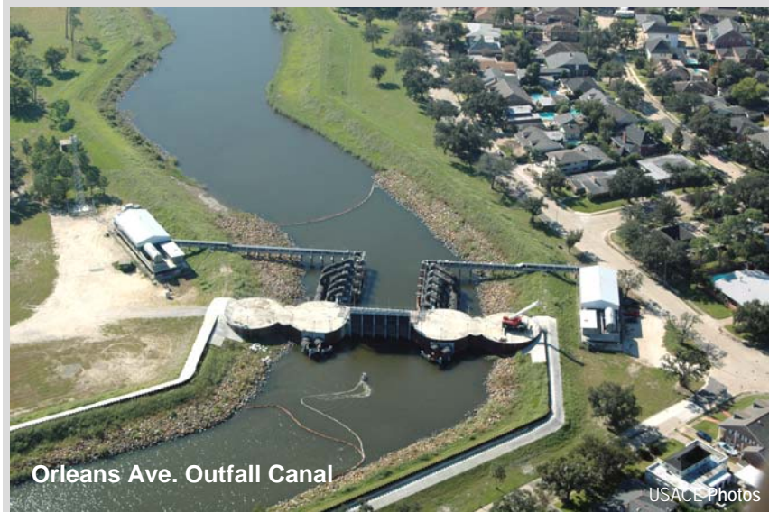
Orleans Ave. Outfall Canal