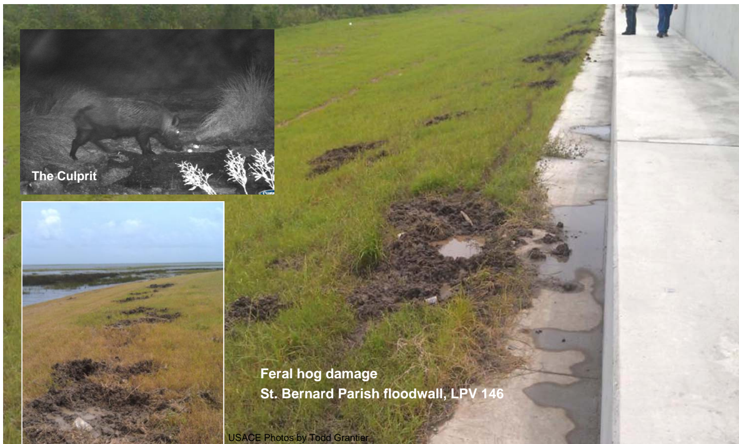
Feral hog damage St. Bernard Parish floodwall, LPV 146