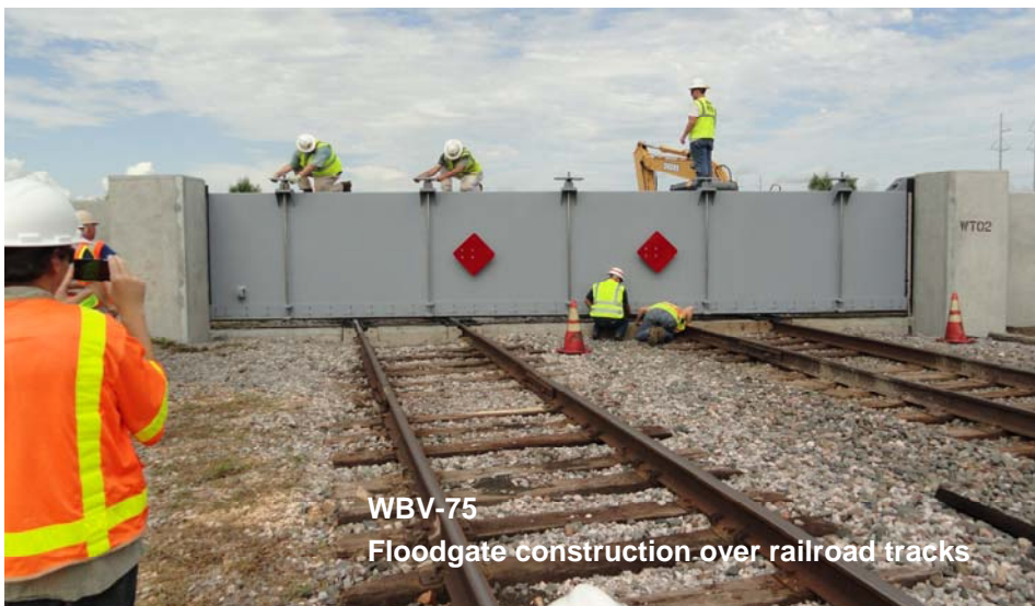
WBV-75 Floodgate construction over railroad tracks