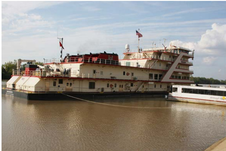
Pictured is the Motor Vessel MISSISSIPPI on the Mississippi River in Vicksburg, Miss., during a high-water inspection trip.

1. Summary report by president of the commission on national and regional issues affecting the U.S. Army Corps of Engineers and commission programs and projects on the Mississippi River and its tributaries.