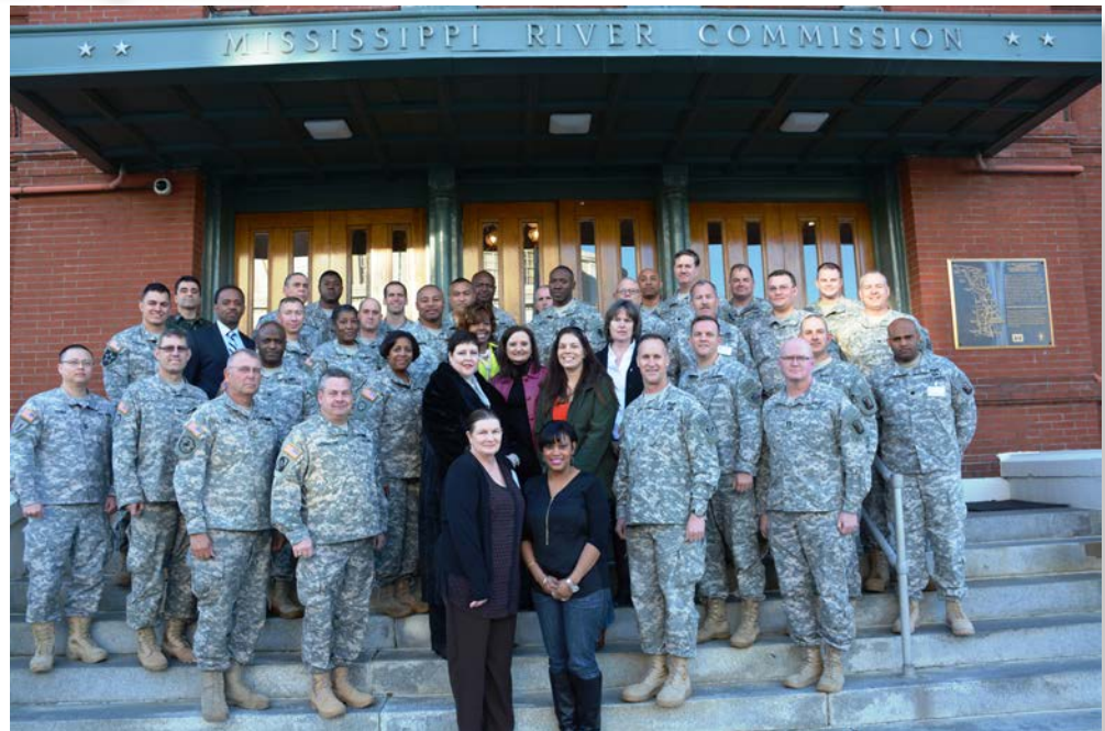
MVD hosted its inaugural Non-Commission Officer & Officer Professional Development for Mississippi's Engineer Regiments, Feb. 19. Pictured are military members from the USACE's Mississippi Valley Division, Engineer Research and Development Center, the 412th Theater Engineer Command, the 168th Engineer Brigade of the MS Army National Guard and the State Headquarters of the Mississippi MSARNG. Also pictured are military members' spouses.

The OPD is the first of many future NCO and OPD meetings that will take place approximately every 60 days, addressing a variety of topics during this FY15 and years to come.