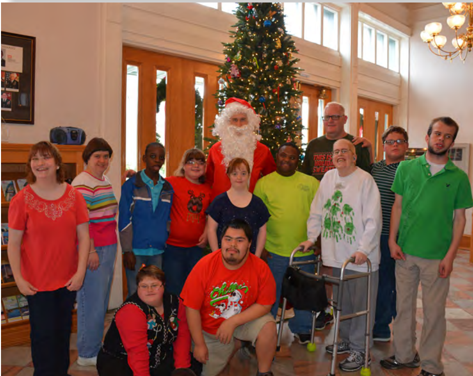
Twelve bright-eyed and very enthusiastic Jacob's Ladder kids sang Christmas carols to MVD employees during their annual tree trimming event, Dec. 3. The kids also spent time with Santa.