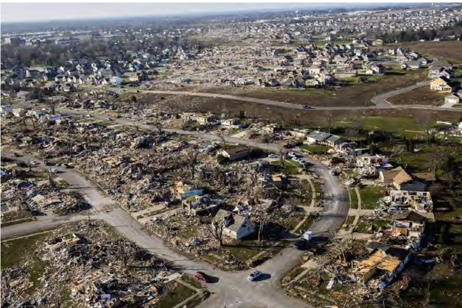
The path of the tornado that struck the city of Washington, Ill.