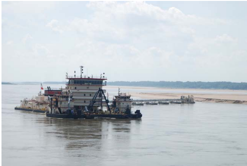
Dredging of the Mississippi River.

The district continually works with our partners and stakeholders to monitor water levels and provide a navigable port channel for normal barge traffic. Due to these low water levels, the Corps has changed the current dredging schedule in order to maintain navigation as long as possible.