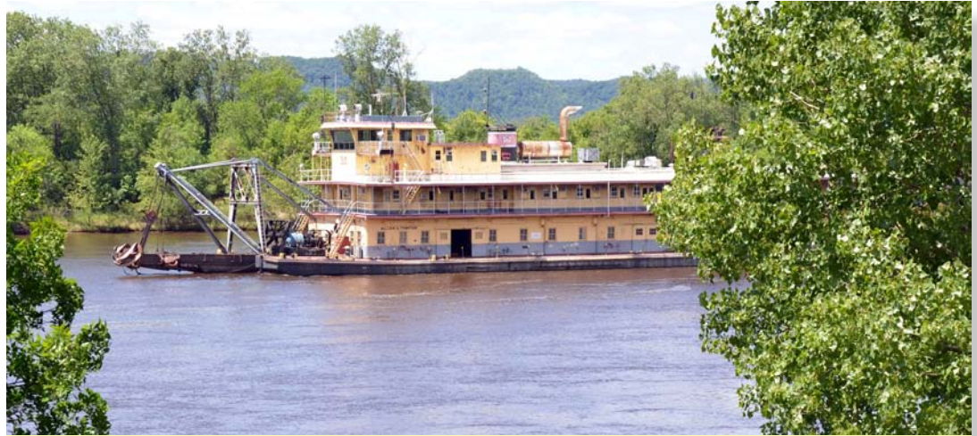
The Dredge William A. Thompson makes its way down the Upper Mississippi River for the last time June 12. After more than 80 years of service with the U.S. Army Corps of Engineers, the Thompson will retire in Prairie du Chien, Wis.