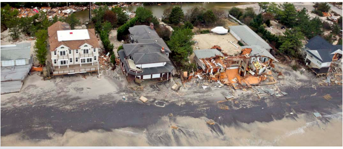
Aerial views show damage from Hurricane Sandy to the New Jersey coast