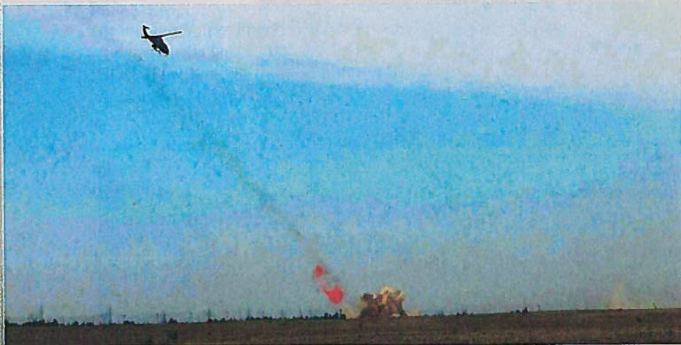
HELLFIRE COMES KNOCKING A Marine Corps AH-1W Super Cobra helicopter attacks an enemy anti-aircraft gun position in April 2003 with AGM-114 Hellfire missiles in northern Iraq. Research into their thermobaric warheads began 35 years ago, a practice we must sustain.

And there are no substitutes for defense labs in energetics. No company does long-term energetics R&D like the defense labs. Moreover, manufacturers are waning. 2