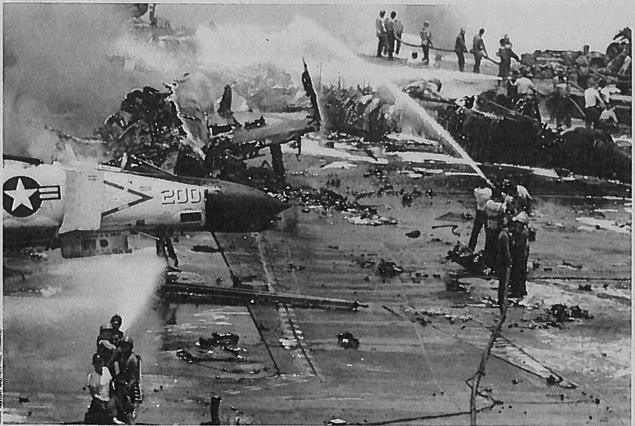
ACCIDENTAL SHIPBOARD DETONATION Energetics expertise helps ensure munitions insensitivity, which might have prevented ordnance detonations in the devastating shipboard fire on board the USS Forrestal (CVA-59) in 1967.

Energetics R&D and its inclusion in systems engineering requires money, people, and time—and all are waning. Between the Berlin Wall's fall in 1989 and 9/11, DOD spending on energetics R&D fell nearly 45 percent. A