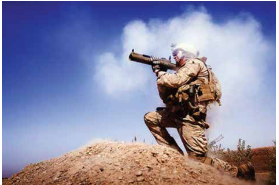
The SMAW employed during a combined clearing mission in Afghanistan.

These changes in shoulder-launched munitions came largely from the R&D of energetic materials, which are ener-