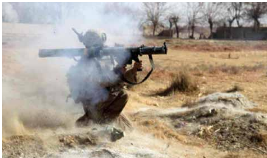
A SMAW in action.

30 pounds, and it is 4 1 / 2 -foot length when loaded made it unwieldy. Also, because of its dangerous backblast in confined spaces, SMAW teams often had to move to open areas to fire, exposing themselves to enemy fires.