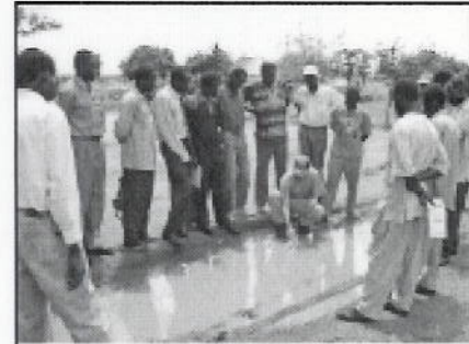
Demonstrating the proper use of the HydroPack filtration bag to local trainers at a Sudanese refugee camp.