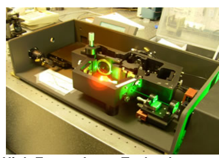
High Energy Laser Technology