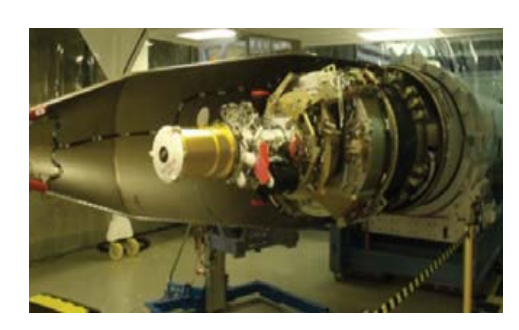
Seeker Technology Approved for Public Release