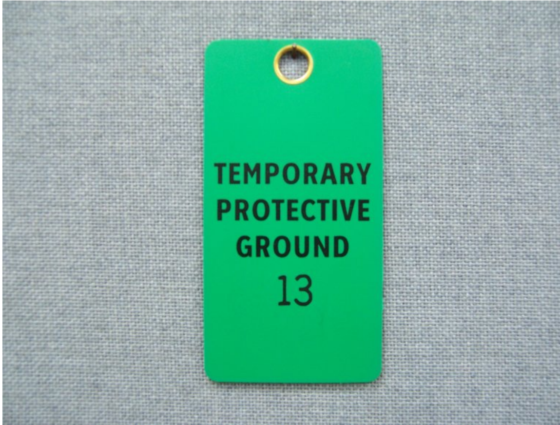
Figure 3. Personal Protective Ground Tag (Example) .

This is an example of a tag that may be used to identify and account for temporary protective Grounds (TPGs). A TPG tag may be developed locally according to local Programs and/or policies.