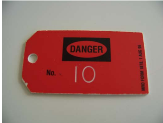
Figure 4. Personal Tag (Red) (Example).