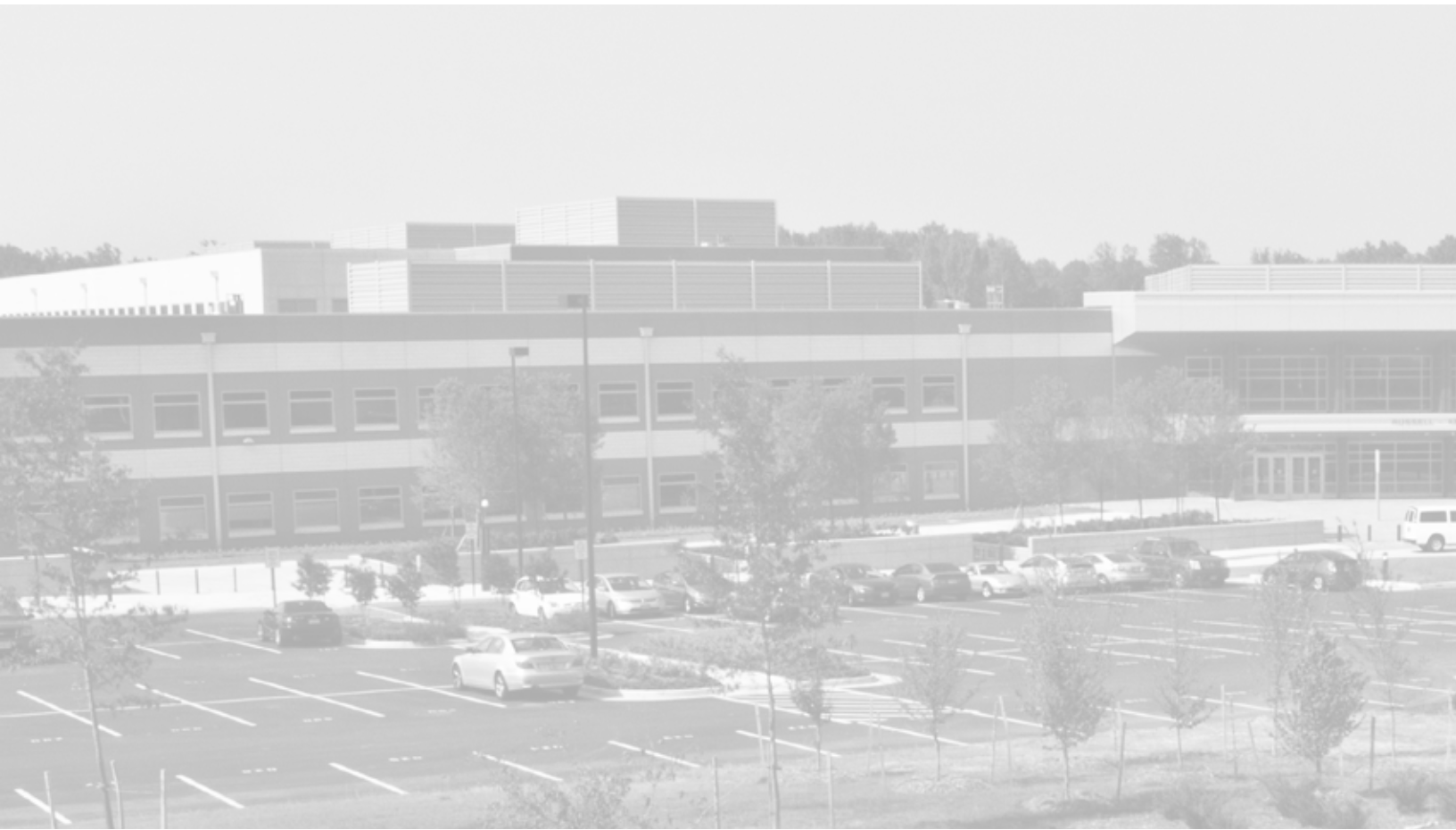
Cover photo: The Russell-Knox Building located at Marine Corps Base Quantico, Virginia. The building is the new home of the Defense Security Service.