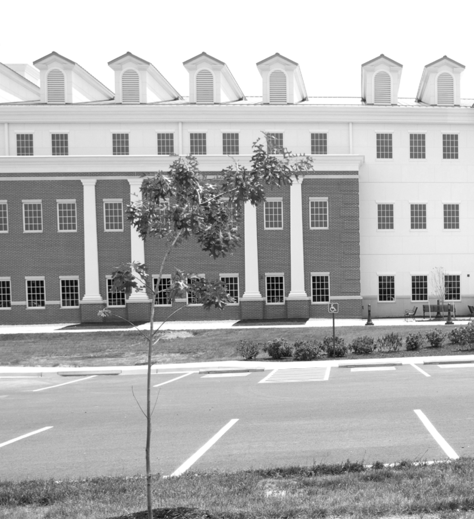
Photo: The new Defense Adjudication Activities Facility located on Fort George G. Meade, Maryland. The building is the new home of the Defense Industrial Security Clearance Office.