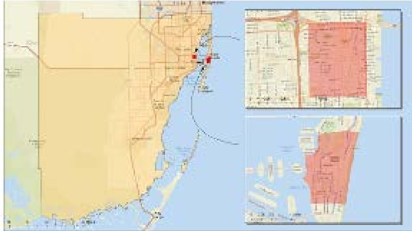
Figure 2. Red and yellow areas where local vector-borne Zika virus transmission has been observed. See guidance for living in or traveling to these areas. (e.g., http://www.cdc.gov/zika/intheus/florida-update.html )