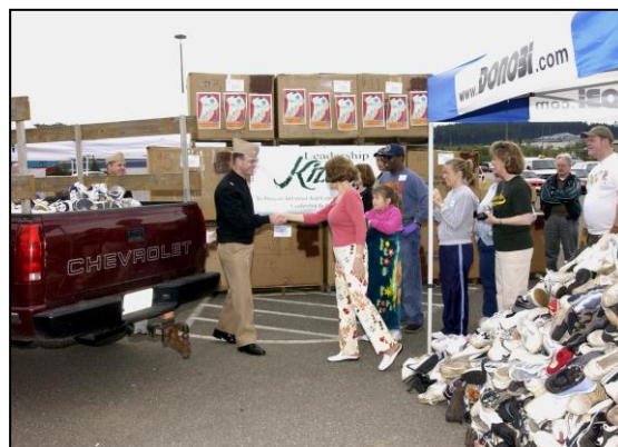
Naval Base Kitsap representatives collect used sneakers for Earth Day shoe recycling.