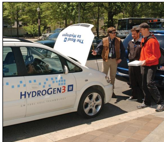
General Motors representatives show a hydrogen-fueled vehicle during an Earth Day event at the U.S. Navy Memorial.