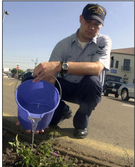
A Sailor waters a flower planted by volunteers during an Earth Day celebration in San Diego.