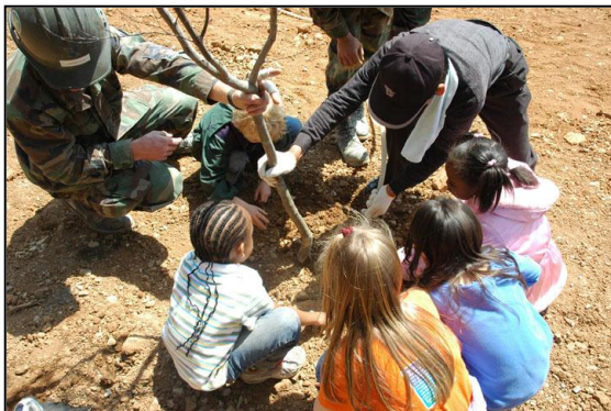
Navy personnel help students plant a tree during an Earth Day event at Commander Fleet Activities, Chinhae, Korea.