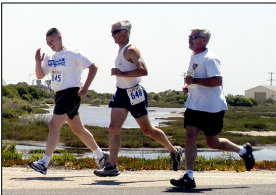
Naval Base Ventura County personnel participate in a 5K Earth Day run.