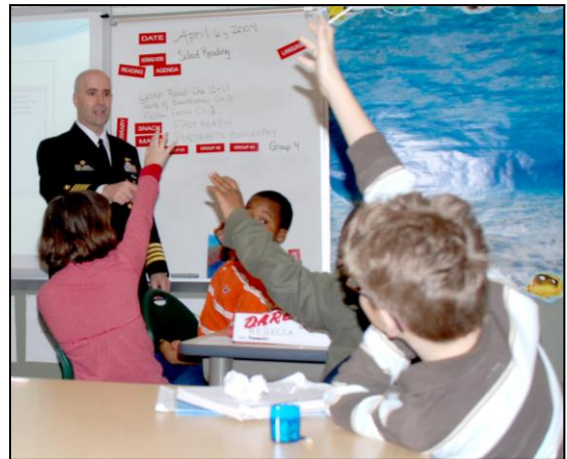
Students answer questions during an Earth Day presentation at Naval Submarine Base New London.