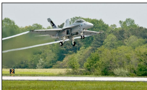
The “Green Hornet,” an F/A-18 Hornet fueled on a 50/50 blend of jet fuel and camelina-based biofuel, completed a test flight at NAS Patuxent River on Earth Day 2010.