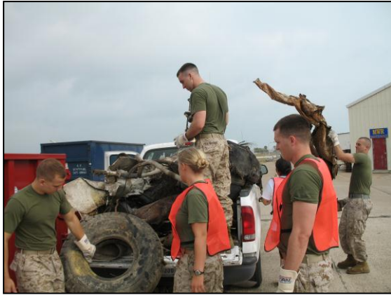
Marines conduct a shoreline cleanup at Naval Air Station Corpus Christi.