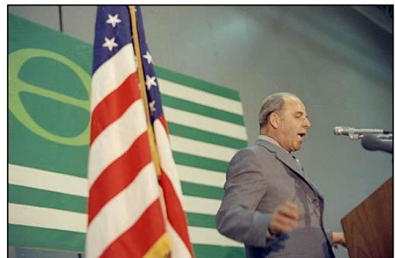
Earth Day founder Gaylord Nelson speaks at a Denver, CO Earth Day event in 1970.

Earth Day was founded in 1970 by Senator Gaylord Nelson (D-Wisc) as a grassroots effort to increase awareness of environmental issues. Since the 1990s, the Department of the Navy and other military services have typically celebrated Earth Day annually with themes, “green” installation events that are open to the public and/or military personnel, participation in community and/or educational outreach activities, and articles or other information products that highlight local Earth Day events and ongoing Navy/Marine Corps environmental and energy programs.