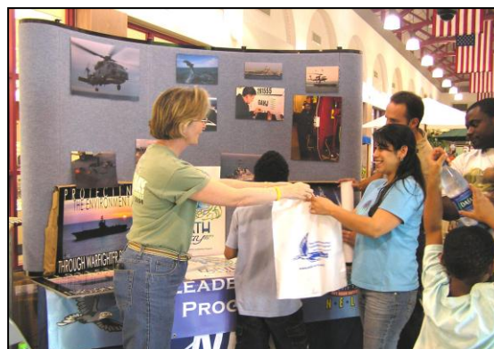
Participants in the Earth Day Jacksonville & Ecology Fair get free information about environmental programs at Commander Navy Region Southeast.

On an annual basis, the Chief of Naval Operations Energy and Environmental Readiness Division (N45) coordinates with Chief of Naval Installation Command (CNIC) headquarters to notify commands of free outreach materials that may be available to support Earth Day. After a given year’s theme is announced, a poster/flier that incorporates the year’s Earth Day theme and has space for commands to customize content will be available for download on the Green Fleet website ( http://greenfleet.dodlive.mil/ ).