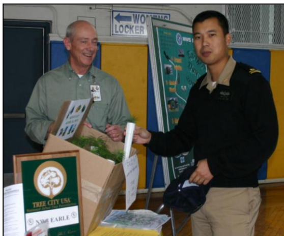
NWS Earle shows off its Tree City USA designation and provides free saplings for Earth Day.