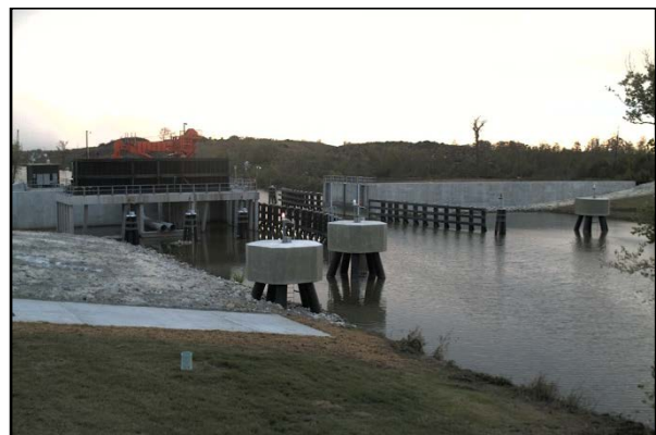
View of construction of the Eastern Tie-in stoplog closure structure at the Hero Canal.