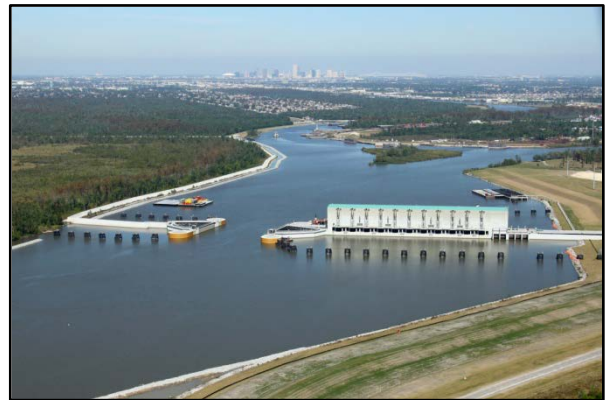
The West Closure Complex includes a 19,140 cubic feet per second pumps station and 225-foot-wide sector gate.