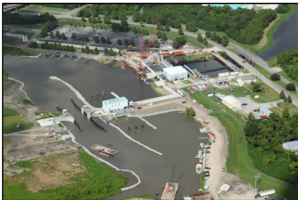
The Bayou Segnette Complex serves as a detention basin for local storm water when the sector gate is closed during tropical storm events