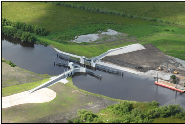
West Bank and Vicinity (WBV) 74 Sellers Canal. This contract is part of the Western Tie-In risk reduction feature.

All WBV contracts have features in place to defend against a 100-year storm surge event; however, construction will continue through spring 2014.