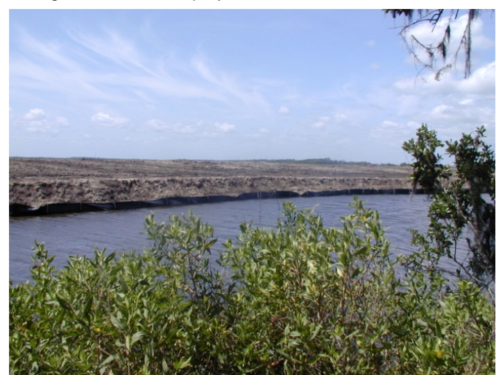
Levee Reach J-1 Construction

Bayou Petit Interim Barge Gate, under construction