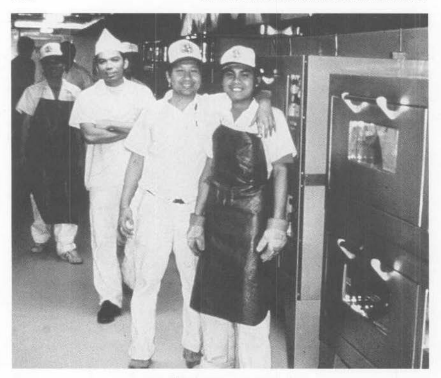
Thai kitchen workers at Ovda