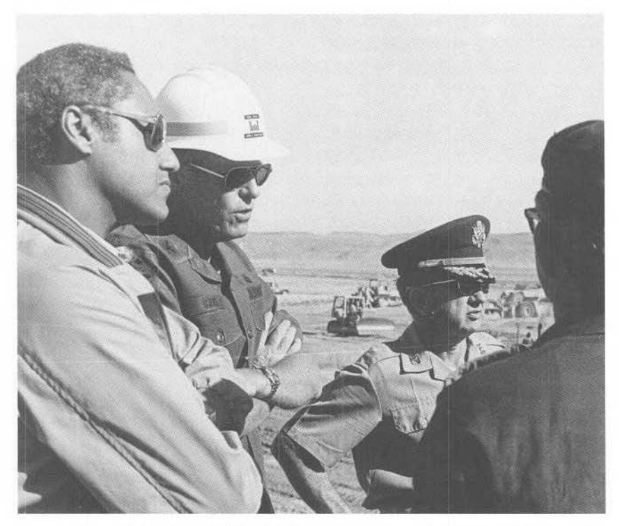
Secretary of the Army Clifford Alexander confers with Colonel Curl and Colonel Gilkey at Ovda.

plex networks of reinforcing steel. In the shelters and other hardened buildings, Israeli design tended to call for smaller bars than those the Americans normally used. The Israelis bent a great number of the small bars by hand into a tight mesh over which they placed concrete. The completed wall resembled glass-encased chicken wire. Like other aspects of Israeli design that tended to be labor intensive, this method reflected the relatively low wages of workers compared to the cost of machines in Israel. Americans, on the other hand, usually faced higher wage and benefit costs. So they used fewer and larger rods, which they bent by machine.<sup>4</sup>