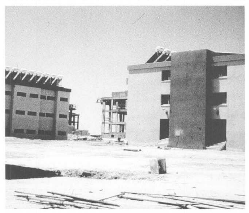
Airmen's dormitories, with solar panels on rooftops, at Ovda.

system put the lion's share of the management burden on Negev Airbase Constructors; the contractor's field facility coordinator became responsible for meeting turnover dates. In doing so, he integrated the procurement and construction schedules and each week updated the exception report on the facility. The contractor also appointed an activation interface coordinator who kept a ninety-day activation schedule and prepared weekly reports on activation and deficiencies for a Corps employee with a similar title. The system was completed with a wrap-up crew. This group of workers from several disciplines eliminated all known deficiencies that they could correct with equipment and materials on hand.<sup>35</sup>