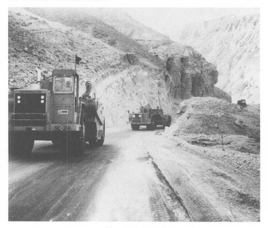
Ramon access road

wells. The constructors also installed 25,000-cubic-meter storage ponds that were lined and covered with plastic. At Ovda, providing a consistent supply for the work force proved early to be a significant problem. Before the purification plant began operation at the end of October, shortages were "severe and inexcusable," according to Curl. In later months occasional breakdowns at the plant required management to issue bottled water for drinking and to pipe brackish water to the billets for sanitary use. <sup>60</sup>