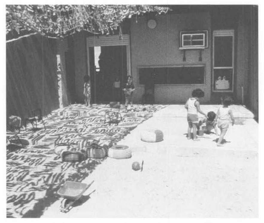
Family housing, complete with camouflage netting, at Ovda.

Mongolian goat grab." The transfer of the ammunition storage area simply "bombed out," according to Griffis. The Americans in the regional civil engineer organization wanted to turn over the entire area at once; the Israelis objected because of pavement flaws in one portion. Problems also appeared at Ovda during turnover of parts of the radio transmitter and receiver work package because of a seven-page list of deficiencies, many of them trivial or irrelevant. Worse yet, Wall found out about the embarrassing situation from Hartung rather than from the area office.<sup>34</sup>