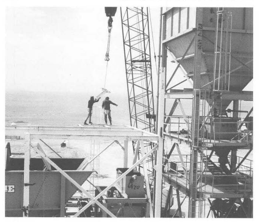
Bulk cement storage facility under construction at Ovda in the spring of 1980.

The engineering division decided to use spread footings, set into bedrock where possible, and elsewhere on structural fill.<sup>70</sup>