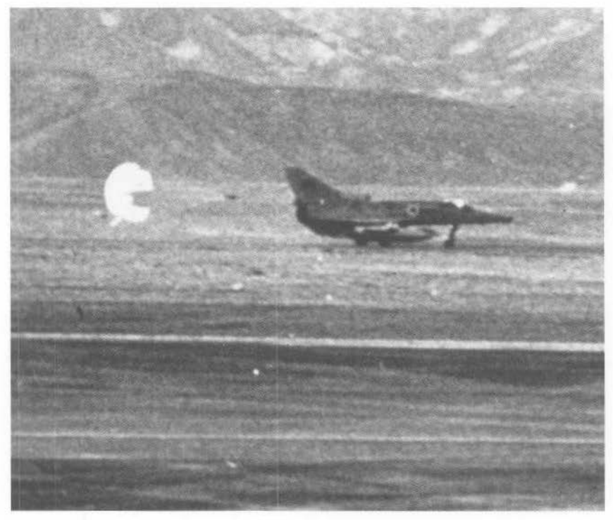
One of the first Israeli Air Force fighters to land at Ovda.

would remember the quality of the work long after adherence to the schedule was forgotten. With this in mind, he insisted that the system for quality verification had to work well. To make sure that it did, he relied heavily on the project engineers. The area office construction branches were the focal points for this effort. The managers of the support contractor's quality assurance teams at the sites reported to the respective chiefs of the construction branches, rather than to their own parent organization. Also within the construction branch, project engineers oversaw specific work items or facilities, ascertaining the adequacy of procurement and making sure that schedules were met as well as ensuring quality. Completely responsible for coordination of design, purchasing, and construction for their facilities, they monitored and reviewed progress daily until final acceptance by the user.<sup>47</sup>