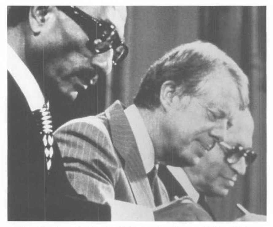
Camp David accords. President Sadat, President Carter, and Prime Minister Begin signing the agreement.

through the Suez Canal for Israeli ships. This document became the basis for the treaty signed in Washington on 26 March 1979. The other agreement concerned a general regional peace. The "Framework for Peace in the Middle East" expressed the interests of both nations in "a just, comprehensive, and durable settlement of the Middle East conflict." It also left the issues of Palestinian rights and the Israeli occupation of the West Bank, Gaza, and the Golan Heights open for negotiations. With none of the key issues regarding the Palestinians and the territories decided, the overall agreement was extremely ambiguous. So the Camp David outcome amounted to a separate peace between Israel and Egypt, a result that did not get to the crux of the regional problem and that had not been sought by the United States or Egypt. 39