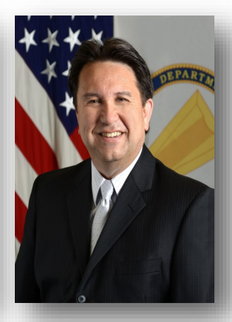
WILLIAM E. JENKINS Deputy Auditor General Installations, Energy & Environment Audits