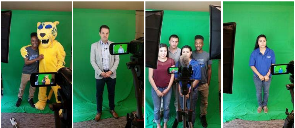
Summer 2015 - "It's On Us" Video Shooting Stills