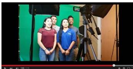
UNT Dallas: It's On Us Video Outtakes

It's On Us to stop campus sexual assault.