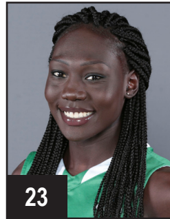
23 Acheil Tac