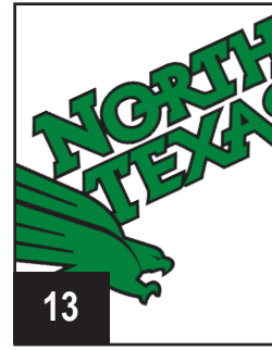
13 Orianna Shillow