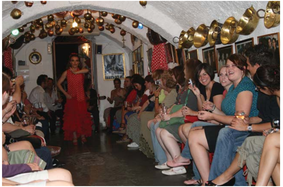
Students enjoying gypsy Flamenco in Spain.

a marvelous time and returned exhilarated and exhausted yet with a new appreciation for the unique art and culture of Spain. ●