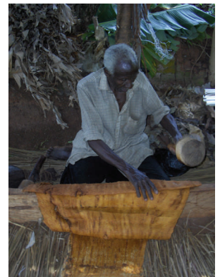
Man in Uganda demonstrating the making of bark cloth.