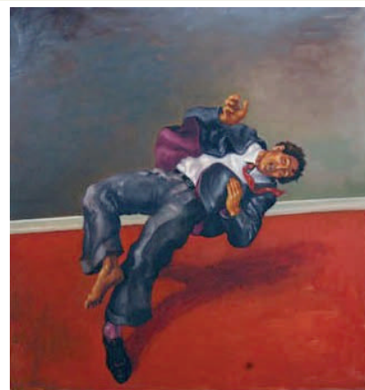
Falling, oil on canvas