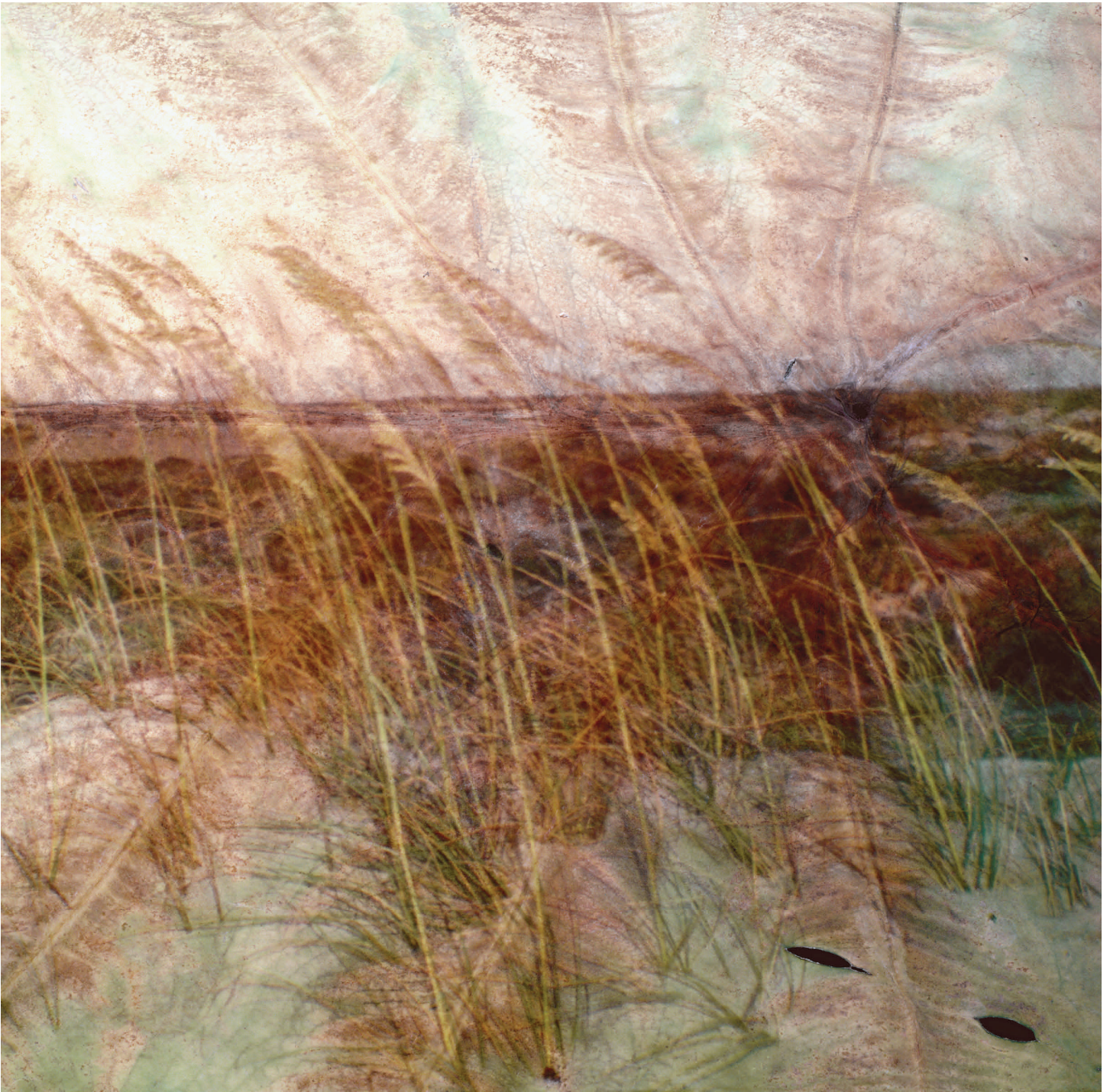
Dornith Doherty, Windswept, 2007, Chromogenic color photograph, Edition of 9, 44 x 44 inches