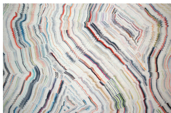
Detail from CQ 06-3 , oil on canvas, 90”x110” by Vincent Falsetta

Continuing his investigation of abstract gesture, process, and expression, Vincent Falsetta’s newest body of work features cascades and vertical striations of color that are at once streaming, free, spontaneous, controlled and deliberate. Using brushes, cardboard, spreaders, palette knives and dry wall spatulas to achieve a rich texture of stripes and ripples, Falsetta achieves a kind of deliberate spontaneity.