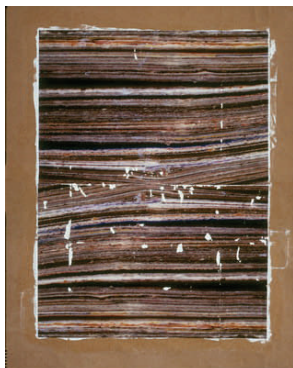
Double Edge #1, 2005 Acrylic, photocopy on paper 15 5/8 x 12 1/2 inches

www.hi-arts.co.uk/iaw-artist-annette-lawrence.html