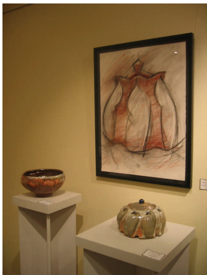
Brenda Lichman Barber's featured work at the Line to Volume show.

The show was an invitational exhibition dedicated to exposing different perspectives on the act of