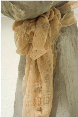
Abiding Delicacy by Lesli Robertson

Our fibers students and alums are a busy bunch. Many of them exhibit locally and beyond. The following is a selected listing of their many activities.