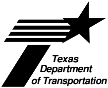
Exhibit A DEVELOPMENT AGREEMENT SITE INVESTIGATION ON HIGHWAY RIGHT OF WAY IN THE DALLAS DISTRICT

_____ is giving written notice of proposed Work to take place within the IH 35E right of way of in Dallas and Denton Counties, TX as follows: (Give general written description of location and work to take place- Do not write "See Attached")