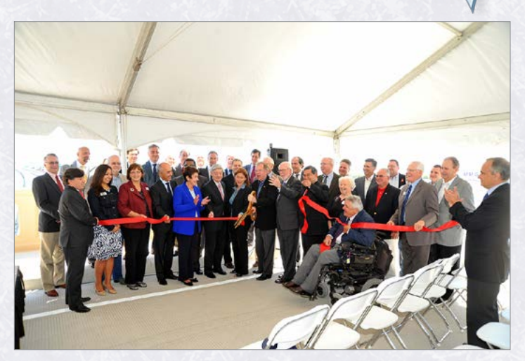
Pictured above: Grand Opening celebration on October 4, 2014

The North Tarrant Express (NTE) rebuild some of northeast Tarrant County's most congested highways. Construction started in late 2010 and completed in October 2014 — nine months ahead of schedule. The project was designed and built concurrently by NTE Mobility Partners (NTEMP) and Bluebonnet Contractors (BBC), shaving several years from the project schedule. Completed, the project provides eight to 10 lanes on Interstate 820 (I-820) and State Highways (SH) 121 and 183. The project improves mobility by almost doubling the existing road capacity with a combination of general highway lanes and continuous frontage roads, along with managed toll (TEXpress) lanes that use dynamic pricing to keep traffic moving at 50 mph. As the first comprehensive development agreement (CDA) project signed in North Texas, the NTE has leveraged a $573 million TxDOT investment into a $2.5 billion infrastructure redevelopment project that reaches from north Fort Worth to near DFW Airport.