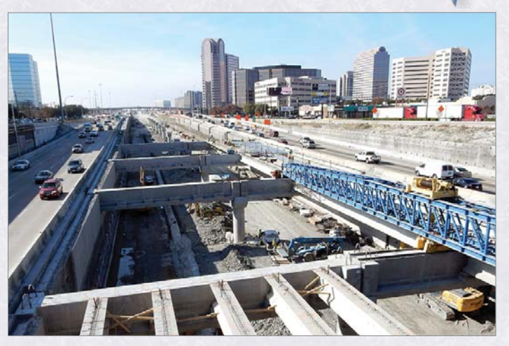
Looking westbound at the construction on the depressed TEXpress Lanes on LBJ Express between Preston Road and the Dallas North Tollway

The LBJ Express project will rebuild one of the busiest and most congested highways in North Texas by 2016. Construction began in early 2011. The project is being designed and built concurrently, shaving several years from the project schedule. When complete, it will provide improved mobility by almost doubling the existing roadway capacity. LBJ Express will feature a combination of four main lanes and two to three continuous frontage roads in each direction, along with three managed toll lanes in each direction that will use fluctuating, congestion managed tolling to keep traffic moving at a goal of 50 mph. It is the first comprehensive development agreement (CDA) project signed in Dallas County. The joint project with LBJ Infrastructure Group (LBJIG) will leverage a $490 million TxDOT investment into $3.1 billion to build, operate and maintain the 16.5-mile project.