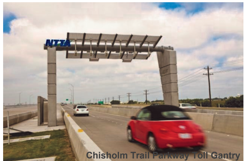
Chisholm Trail Parkway Toll Gantry