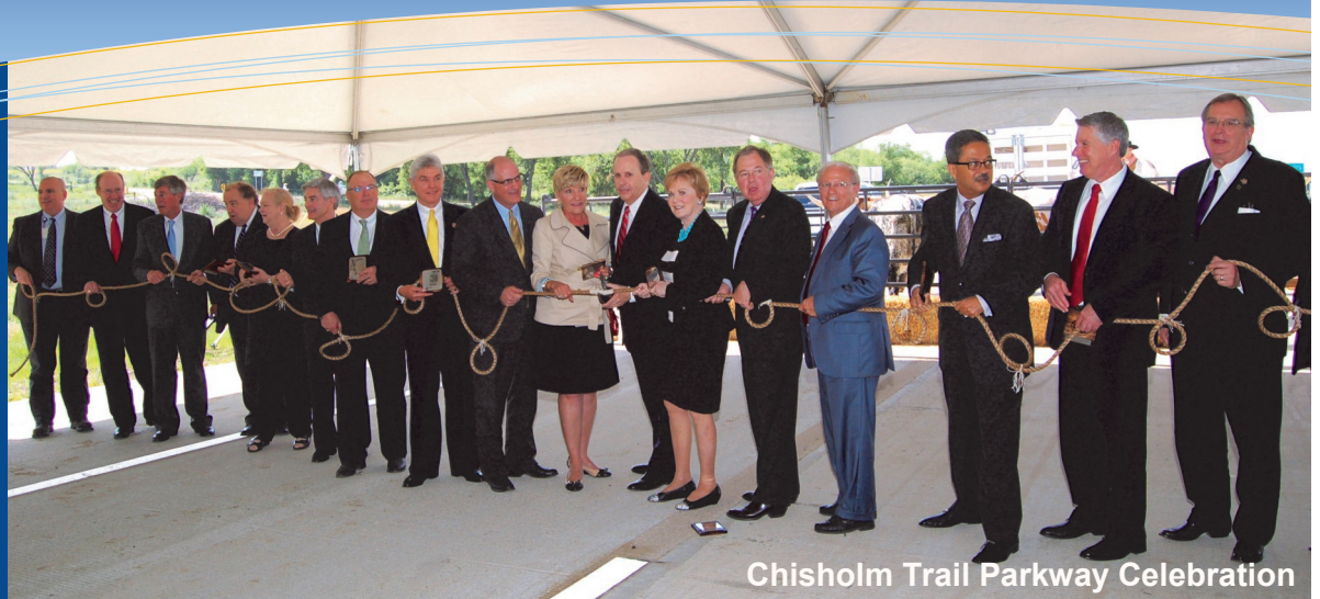
Chisholm Trail Parkway Celebration