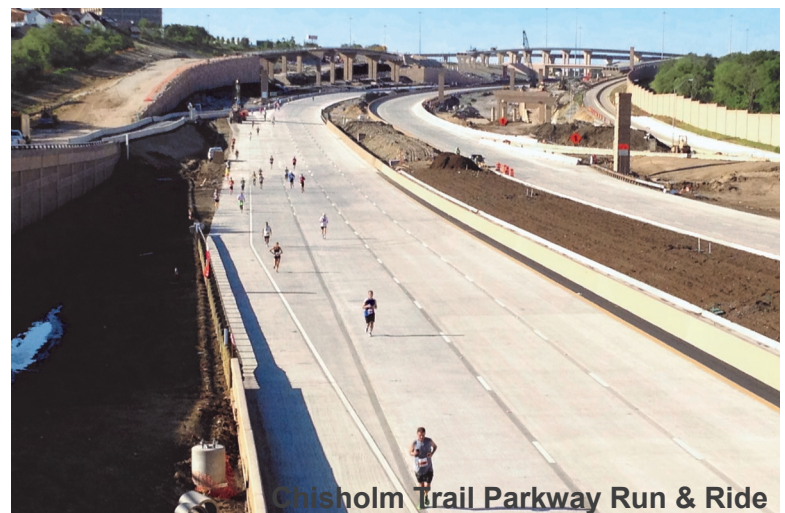
Chisholm Trail Parkway Run & Ride