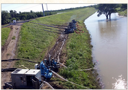
TxDOT crews pumping tens of millions of gallons of water back inside the levees of the Trinity River and off of State Loop 12.