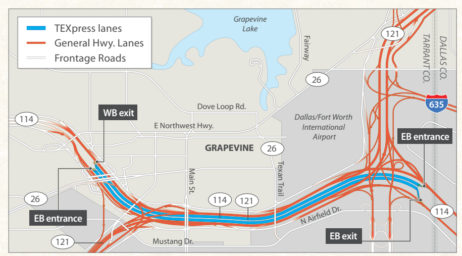
NOTE: Highlighted areas are not drawn to scale.

Toll rates will be posted and clearly marked on electronic signs prior to drivers entering the TEXpress Lanes. In the future, tolls will fluctuate according to traffic volume and rate of speed. Electronic sensors in the corridor will measure