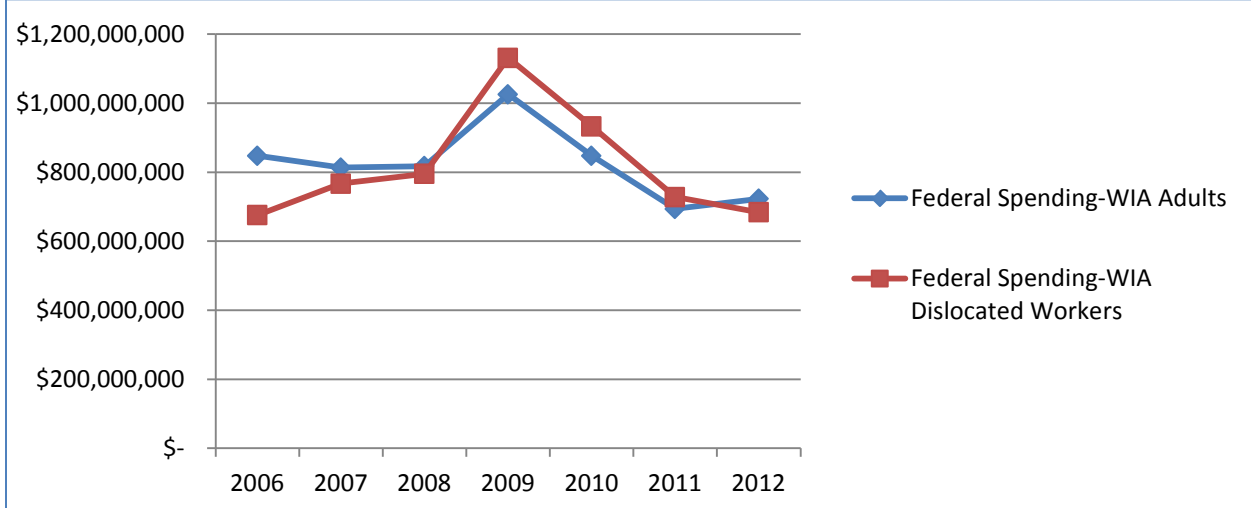
Table 2: Total Spending for WIA Adult and Dislocated Worker Programs, Program Years 2006-2012

Source: DOL ETA WIA National Summary of Annual Performance Data 8