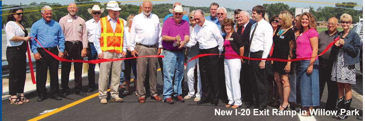
New I-20 Exit Ramp in Willow Park