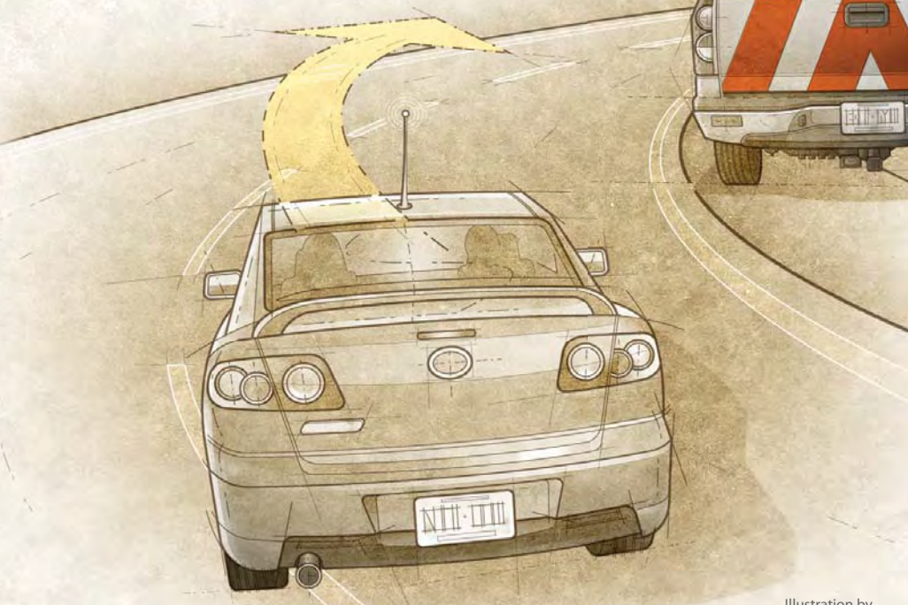
Illustration by Dean Hollingsworth

So the next time you see a TxDOT vehicle or equipment on the side of the road with blue and amber flashing lights, obey the law, do your part to promote safety on our roadways and move over and slow down. Our TxDOT employees and their families thank you!