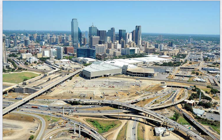
Horseshoe construction : Above is a view of new construction looking east toward downtown Dallas just west of the Dallas Convention Center.

This project is made possible by legislation passed in 2011, which provided TxDOT with additional tools in the form of "design-build" authorization as well as additional Proposition 12 funding. The new tools provide the opportunity to close the project funding gap and construct the project at least four years sooner than conventional project development methods could. Utilizing design-build allowed the project to get underway by late-2013 and be completed as early as 2017.