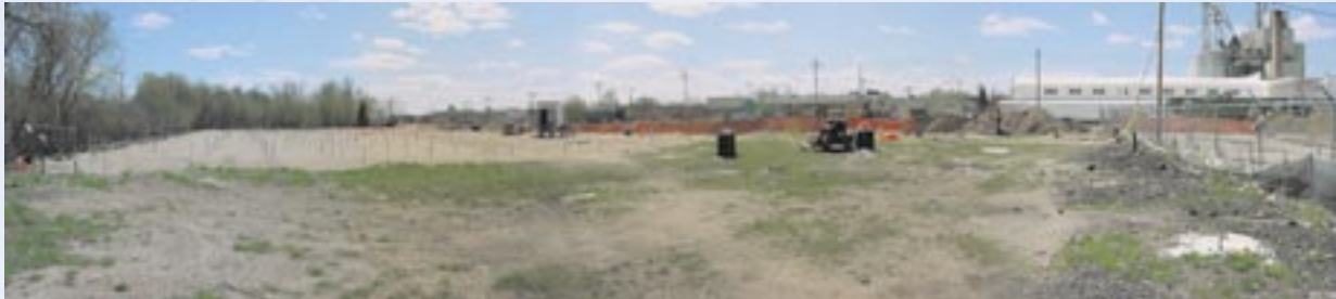
CLASS V WELL - Aquifer Remediation Well

All injection wells are not waste disposal wells. Some Class V wells, for example, inject surface water to replenish depleted aquifers or to prevent salt water intrusion. Some Class II wells inject fluids for enhanced recovery of oil and natural gas, and others inject liquid hydrocarbons that constitute our nation's strategic fuel reserves in times of crisis. But most injection wells have the potential to inject fluids that may cause a public water system to violate National Drinking Water Standards. These standards provide our safety net against waterborne disease and other health risks.