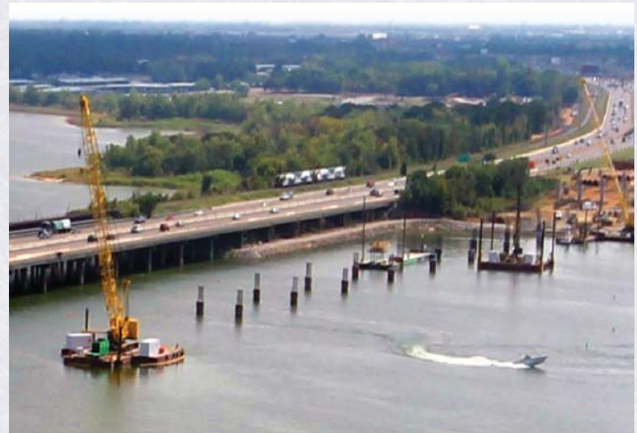
Pictured above is the column construction for the new southbound Lewisville Lake Bridge.