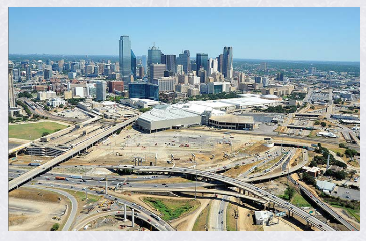
Horseshoe construction : Above is a view of new construction looking east toward downtown Dallas just west of the Dallas Convention Center.

This project is made possible by legislation passed in 2011, which provided TxDOT with additional tools in the form of "design-build" authorization as well as additional Proposition 12 funding. The new tools provide the opportunity to close the project funding gap and construct the project at least four years sooner than conventional project development methods could. Utilizing design-build allowed the project to get underway by late-2013 and be completed as early as 2017.