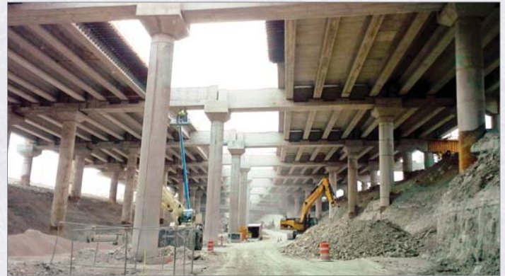
Pictured above is the construction of the TExpress Lanes between Preston and Josey Lanes.

The LBJ Express project will rebuild one of the busiest and most congested highways in North Texas by 2016. Construction began in early 2011. The project is being designed and built concurrently, shaving several years from the project schedule. When complete, it will provide improved mobility by almost doubling the existing roadway capacity. LBJ Express will feature a combination of four main lanes and two to three continuous frontage roads in each direction, along with three managed toll lanes in each direction that will use fluctuating, congestion managed tolling to keep traffic moving at a goal of 50 mph. It is the first comprehensive development agreement (CDA) project signed in Dallas County. The joint project with LBJ Infrastructure Group (LBJIG) will leverage a $490 million TxDOT investment into $3.1 billion to build, operate and maintain the 16.5-mile project.