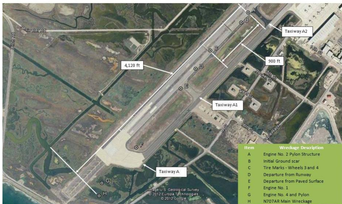
Figure 2. Aerial photograph of the debris field.

As shown in figure 2, a 4,120-foot debris field began about 7,500 feet from the approach end of runway 21, near taxiway A2. Main landing gear tire marks indicated that the airplane regained contact with the runway about 900 feet into the debris field, departed the runway on a 218° heading near taxiway A1, and continued across the grass infield and taxiway A before coming to rest in a saltwater marsh where it caught fire. The first pieces of wreckage found along the debris path were a fragment of the No. 2 engine pylon torque bulkhead and a piece of the No. 2 pylon overwing fitting, located just past taxiway A2. The No. 1 engine nose cowl was found in the grass infield near taxiway A about 450 feet further into the debris field and left of the runway surface; it exhibited crush damage consistent with contact with the No. 2 engine. The No. 2 engine nose cowl was located near the runway arresting gear on the left side of the runway at the 8,500 foot point. The No. 2 engine was found about 230 feet further, on the left side of the runway surface. Intermittent scrape marks leading to the No. 2 engine were observed on the runway beginning about 7,800 feet, consistent with the engine tumbling after separating from the wing.