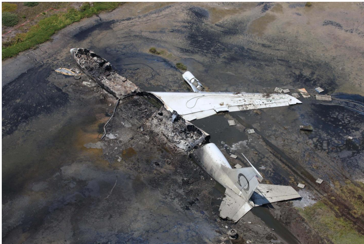
Figure 3. Aerial photograph of airplane wreckage.

Fire consumed the top of the cabin and the cockpit (see figure 3). The main wreckage, which came to rest in the wetland marsh, consisted of the cockpit and cabin; the right wing with the No. 3 (right inboard) engine partially attached; the empennage; and the inboard half of the left wing, which sustained thermal damage and was submerged in water. Scattered debris aft of the main wreckage included the nose gear, remnants of the burned outboard left wing, right main landing gear truck, and No. 4 (right outboard) engine.