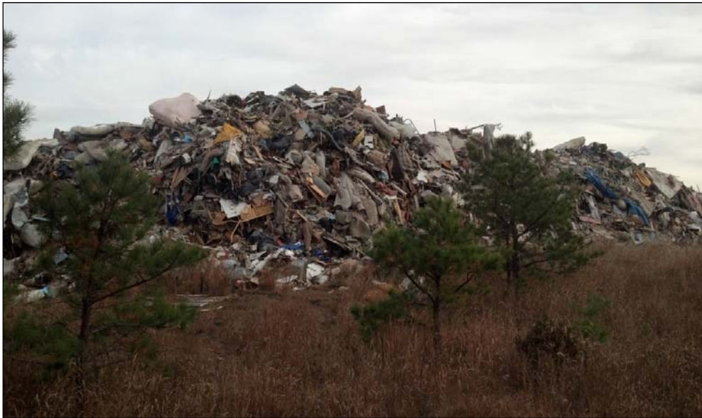
Figure 1: Debris at Temporary Staging Site