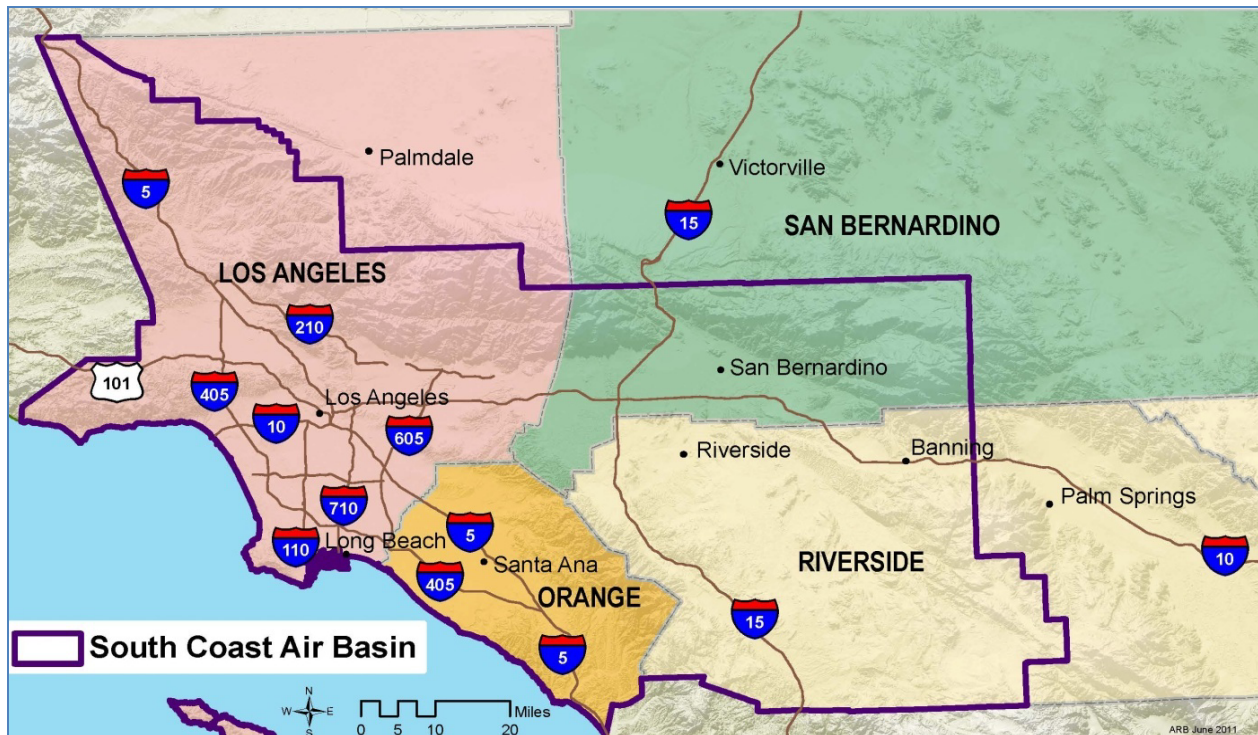
Figure 1: Map of the South Coast Air Basin