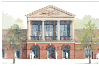
Partial façade of the planned new Yorktown Victory Center building, showing the main entrance.

preliminary architectural design of the building and site plan by Westlake Reed Leskosky of Cleveland, Ohio, and Washington, D.C., and exhibit schematic design work by Gallagher & Associates of Bethesda, Md. Guided by a master plan adopted in 2007 by the Jamestown-Yorktown Foundation Board