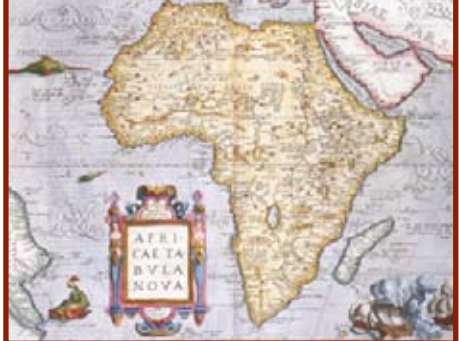
Map of Africa, Abraham Ortelius

ous business. Superstitions persisted about what lay beyond Africa's Cape of Good Hope, as no European had even seen the west coast of Africa beyond the Sahara. There were no maps or charts and very little knowledge of winds or currents.