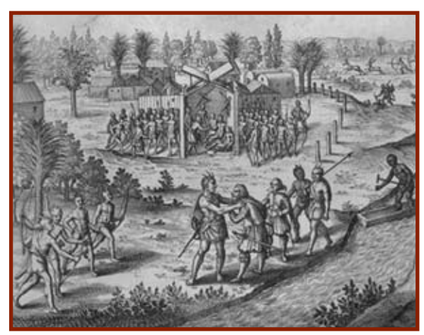
Ralph Hamor visits Powhatan, Theodor de Bry

From the time of their arrival, the English settlers at Jamestown faced food shortages and even starvation, due in part to the new climate and their lack of experience and manpower to grow crops in Virginia. Recent scientific investigation has yielded evidence to show that there also may have been a period of severe drought around the time of settlement, which could have affected the ability of both the colonists and the Powhatans to grow food. Other sources indicate it was the drinking brackish river water (a mixture of fresh and salt water), which caused them to be more susceptible to illnesses