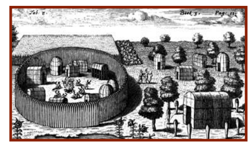
Indian village, from Robert Beverley's The History and Present State of Virginia

may also have been placed in small houses in the middle of fields to act as 'scarecrows' to keep the crows and other animals from eating the corn crop. Everything they used came from their environment. Both men and women painted their bodies, using paints from oils, bloodroot and animal fats. They rubbed themselves with bear fat to repel mosquitoes and to keep them warm during the cold months. Women pierced their skin to make tattoos of various animal and floral designs. As a mark of wealth and status, the Powhatans wore necklaces and ear ornaments made from materials such as shells, copper and freshwater pearls. In the winter, they wore deerskin with the fur toward