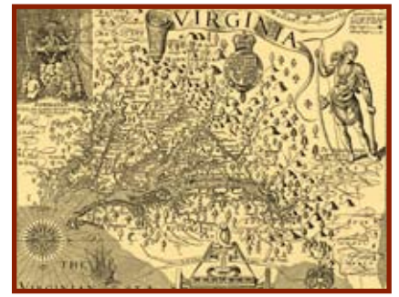
John Smith's Map of Virginia

with tides being felt upstream almost as far as Richmond. After planting a cross at Cape Henry, thanking God for their safe voyage, the 104 English men and boys along with the ships' crew sailed up the James River, which they named after their King. After exploring up and down the James River for two weeks, they arrived at a point that seemed to fit the instructions they'd been