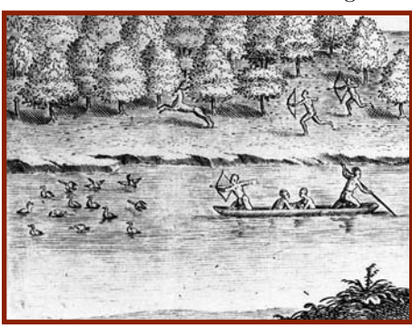
Virginia hunting scene, Theodor de Bry

Although all of the Powhatan Indians used basic tools, it generally was the men who hunted, fished, made tools and, most likely, cleared the land for gardens, as this was very arduous work. The women typically did the farm-