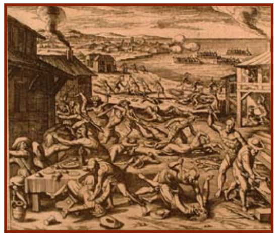
1622 Indian uprising, Theodor de Bry

Prior to these attacks in 1622, the Virginia Company had dramatically increased the number of colonists sent to Virginia every year, and the population had tripled within three years, threatening Powhatan territory between the York and James Rivers. By 1622, Indians were forced to move inland away from their traditional river valley homes. The lack of communication that existed between the two groups in 1607 did not improve sufficiently to bridge cultural differences as deep and sensitive as land ownership. As a result of the treaty in 1632, the English tried to limit contact between the Indians and the colonists, including limiting trade. In 1646, after a second Indian uprising and the death of more than 400 colonists, the Powhatans suffered a final defeat and signed a formal peace treaty with the Virginia government. This treaty barred the Indians from traveling on the James-York peninsula.