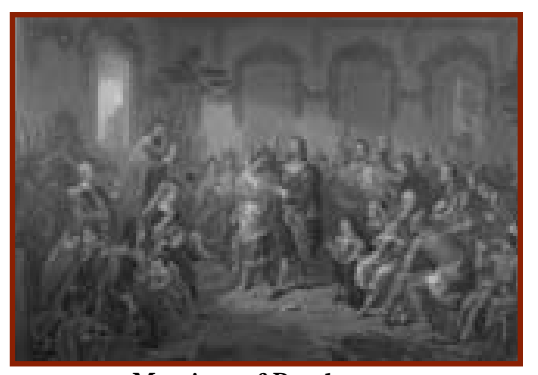
Marriage of Pocahontas

lands. Opechancanough was patient and waited until the time was right. In 1622, he led the first coordinated attack on several English plantations, killing more than 300 of the 1,200 colonists. Jamestown was warned and escaped destruction. This led to a decade of open warfare, culminating in a treaty in 1632. A decade of tenuous peace followed.