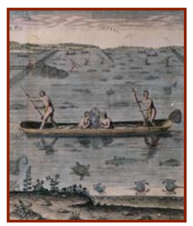
Their manner of fishing, Theodor de Bry

Powhatan villages were located along the banks of larger rivers or major tributaries. A Powhatan house was called a yehakin (not a wigwam) and was made from natural materials found in the surrounding environment. Its framework was made from saplings of native trees such as red maples, locusts and red cedar. The framework was then covered with either bark or mats made from marsh reeds. Houses were located near the planting fields, which was important because the Powhatans likely had to move whenever