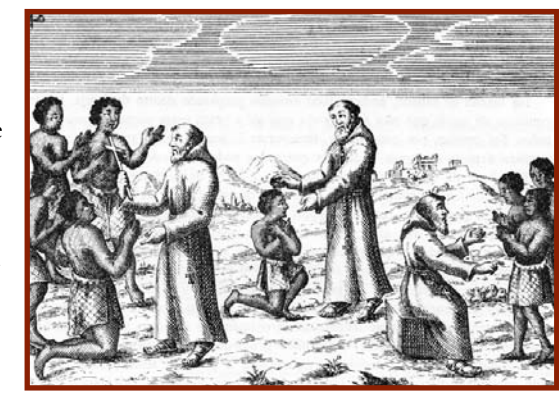
Portuguese baptizing Africans, Fortunato da Alemandini

year a group of representatives called burgesses was elected to make laws – a first for this part of the world. But it