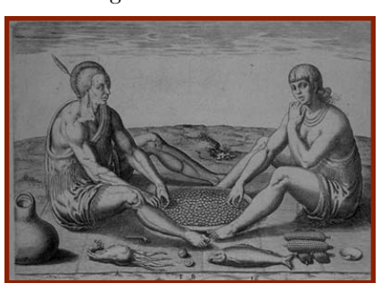
Their sitting at meat, Theodor de Bry

brush cover was sparse, the Powhatans hunted and ate game. There was a lot of game in the area: raccoon, deer, opossum, turkey, squirrel and rabbit, among others. Some of these, such as the opossum and raccoon, were strange and unfamiliar to the English, so they adopted the Powhatan names for them. Of all the game