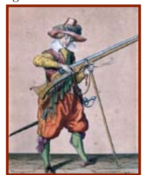
Engraving by Jacques de Gheyn

eastern Virginia for thousands of years and had formed a hierarchical political structure and complex trade relationships. The English had begun to explore westward, looking for new lands and resources partly due to economic events. In 1619 Africans had been transported to Virginia against their will. In Africa, they had been part of a highly developed culture in what is present-day Angola.