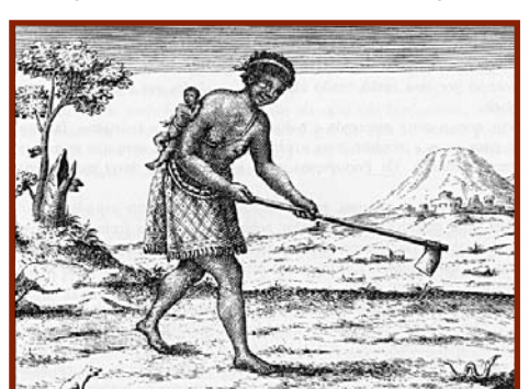
Woman hoeing, Fortunato da Alemandini

The civilization that the 1619 West Central Africans left behind in Angola was highly developed and included both walled urban centers and rural regions. The Angolans brought useful skills and knowledge to the Jamestown colony,