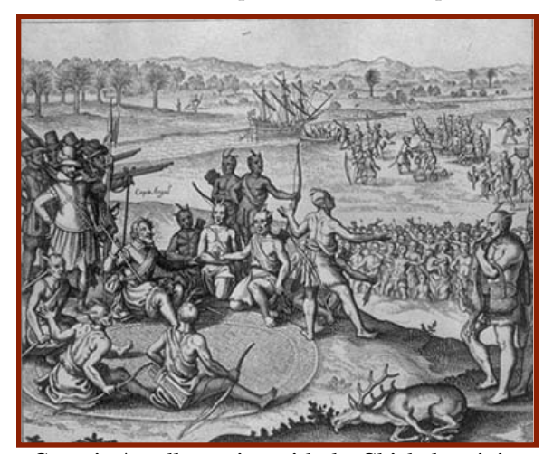
Captain Argall meeting with the Chickahominies, Theodor de Bry

such as typhoid and dysentery that proved to be the principal cause of the settlers' sicknesses and death. Before the end of September 1607, an epidemic swept the settlement and left almost half of the 104 men and