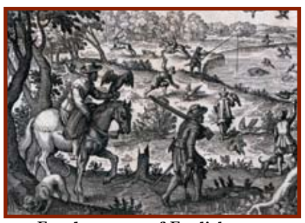
Employments of Englishmen, Theodor de Bry

At the same time these Englishmen were looking for ways to invest their wealth, others were not so fortunate. The small farmers, who for generations had rented their small plots of land from large landowners, lost their farms and their jobs when the land was enclosed with fences to raise sheep. Men, women and children were uprooted and drifted from the countryside to towns and cities looking for work. Many were reduced to begging or to stealing to survive. Migrating to a new world seemed a hopeful choice for many of these people, as it did for English leaders who saw colonies as a way to solve the problem of the growing numbers of displaced and poor people.