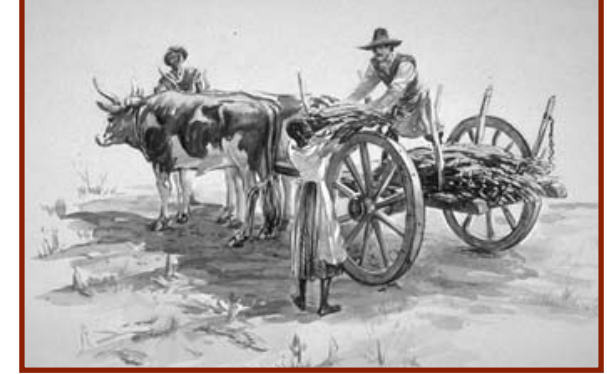
Loading tobacco, Sidney King

Africans in seventeenth-century Virginia were separated from the English majority by race and culture, and ultimately by law. In Virginia during much of the early seventeenth century, the supply of English indentured servants was such that finding workers was not a problem. Initially, the first Africans were probably servants and lived much like white indentured servants did; indeed, Africans sometimes lived with white servants. Some eventually won their freedom and acquired their own land and servants. Until the late seventeenth century, there were no special legal restrictions on free Africans in Virginia, though they were usually poorer on average than other free persons.