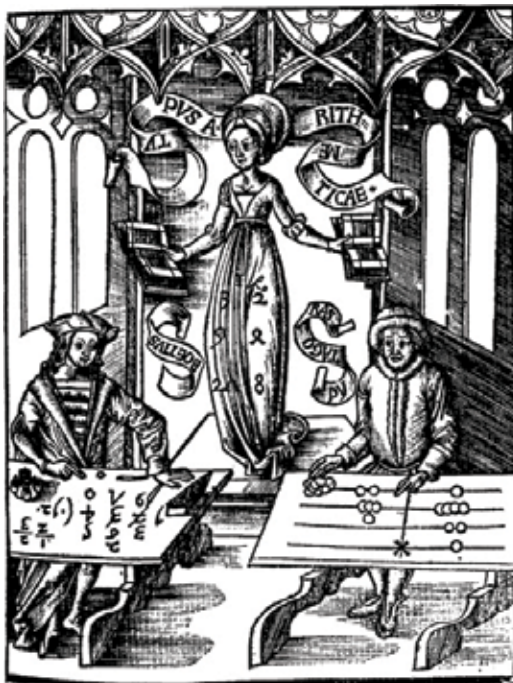
An illustration in Gregor Reisch's Margarita Philosophica , published in Freiburg in 1503, depicts counter reckoning and pen reckoning.

Certainly some of the older colonists who came to Jamestown would have known how to reckon by counter, and enough counters or jetons have been recovered from Virginia Company archaeological sites to suggest that this older style of arithmetic may have been in some limited use in Virginia during the early days of settlement. Casting by counter doesn't apparently die out completely in England and Europe until the 1640s, when the last European manufacturers of counters cease production. Ironically, just as casting counters finally fade away as practical tools of business and administration, they experience a brief second life in England as trinkets for the wealthy, with our silver Charles I counters as a case in point. ■