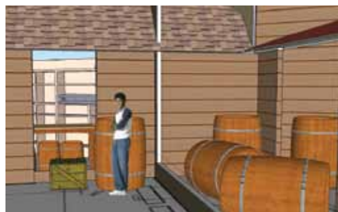
A sketch created through a software program aids in determining the quantity and size of items – including the number of hogsheads – to be located within a re-created store setting.

Historical clothing manager Chris Daley leads the team who will make the