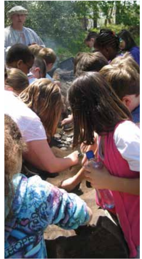
Using oyster shells to shape a dugout canoe at Jamestown Settlement is among hands-on experiences available to students participating in the elementary school scholarship program.

In the 2013-14 school year, the program will be offered thanks to gifts and grants from the Oscar F. Smith/Marjorie Smith Charles Fund of The Community Foundation Serving Richmond and Central Virginia , the Camp family foundations, The Huston Foundation, and Wells Fargo. ■