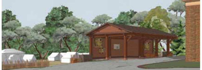
An informational pavilion that will help American Revolution Museum at Yorktown visitors with the transition from indoor galleries to the outdoor living-history experience will be named for TowneBank.

A pavilion that will help guests with the transition from the indoor gallery experience to the outdoor living-history experience in the re-created Continental Army encampment and Revolution-period farm will be named for TowneBank in recognition of its commitment.