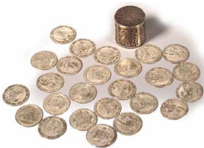
A silver counter box and 26 silver counters stamped with the images of England's kings and queens date to the reign of King Charles I (1625-49) and likely were intended for decorative rather than practical use. Jamestown-Yorktown Foundation collection.

Arabic numerals and the more streamlined arithmetic that the numerals make possible came to the Mediterranean world long before there was a full acceptance of this “new math” in Northern Europe. By the beginning of the 13th century, Italian mathematician Leonardo Fibonacci had developed new methods of commercial bookkeeping, the conversion of weights and measures, and the calculation of interest using Arabic numbers. By contrast the older