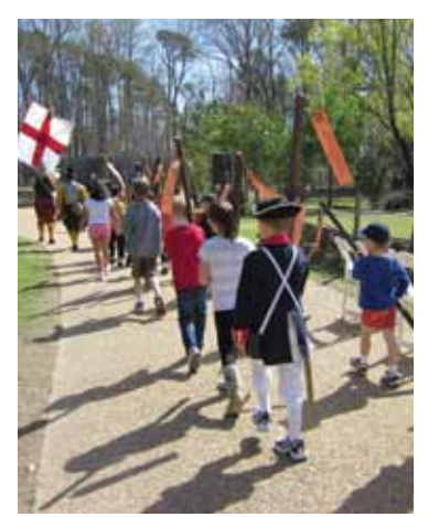
Children march with wooden muskets for the annual "Military Through the Ages" parade on Saturday.

This year also marks the bicentennial of the War of 1812, depicted by Fort Norfolk Garrison, with stations to "recruit" visitors and allow them to drill with