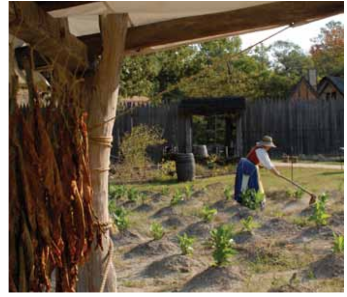
Two stages of tobacco production are shown outside Jamestown Settlement's re-created 1610-14 fort, with examples of tobacco leaves hanging to cure and young tobacco plants under cultivation. Tobacco as a commodity is the subject of "Virginia Economy in the 17th Century" lectures on April 28 and May 19.

a Commodity" on April 28. The lecture draws from Dr. Norton's book Sacred Gifts, Profane Pleasures: A History of Tobacco and Chocolate in the Atlantic World, which explains how these two goods that originated in the Americas became European continued on page 2