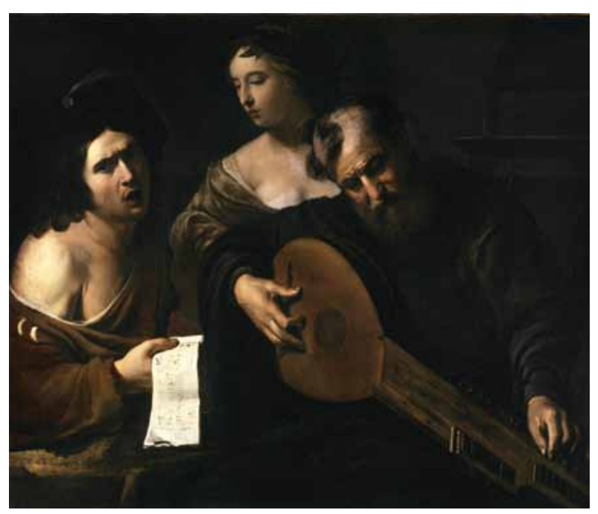
"A Musical Group," circa 1620, by a follower of Michelangelo Merisi da Caravaggio, is one of 65 objects from the collection of the Virginia Museum of Fine Arts on exhibit at Jamestown Settlement through August 15 in "The 17th Century: Gateway to the Modern World." The exhibition is featured in a June 9 lecture, "Captains, Monarchs, Philosophers, and Merchants: Picturing the 17th Century."