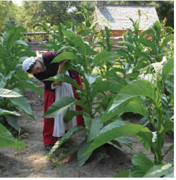
The cultivation of tobacco in Virginia in the 17th and 18th centuries is interpreted at Jamestown Settlement and the Yorktown Victory Center.