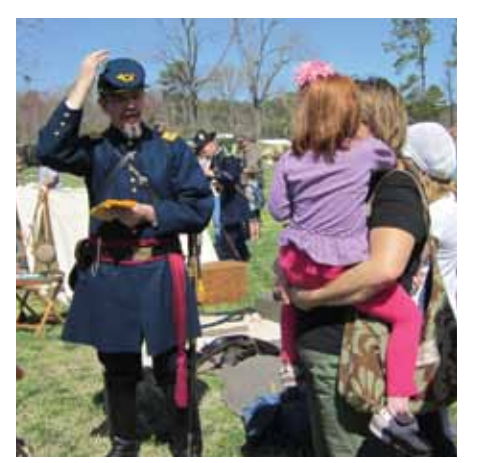
A 3rd U.S. Regular Infantry re-enactor shows a young visitor the uniform of a Civil War Union soldier.

Re-enactors representing World Wars I and II, the Vietnam War and