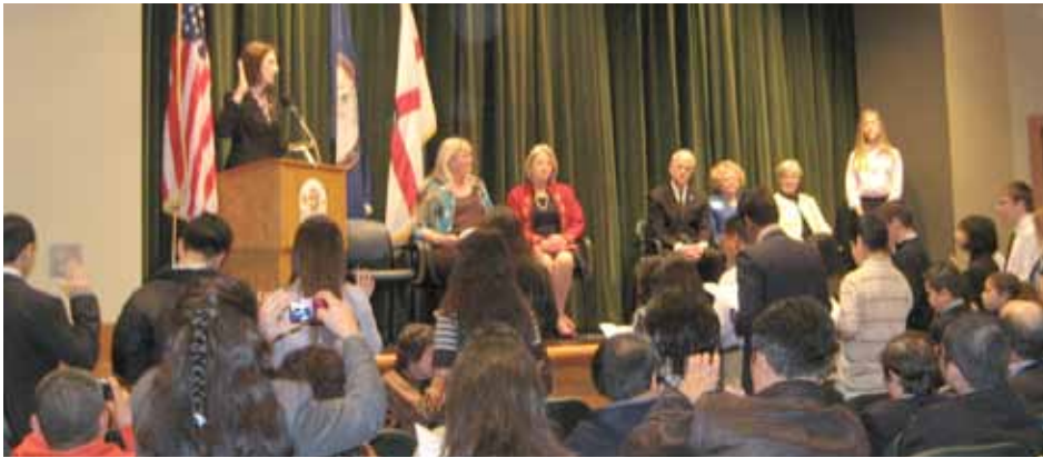
Participants in last year's Certificate of Citizenship ceremony at Jamestown Settlement take the Oath of Allegiance.

The citizenship event was first held at Jamestown Settlement in March last year. This year's ceremony begins at 2 p.m. and is open to the public on a space-available basis. ■