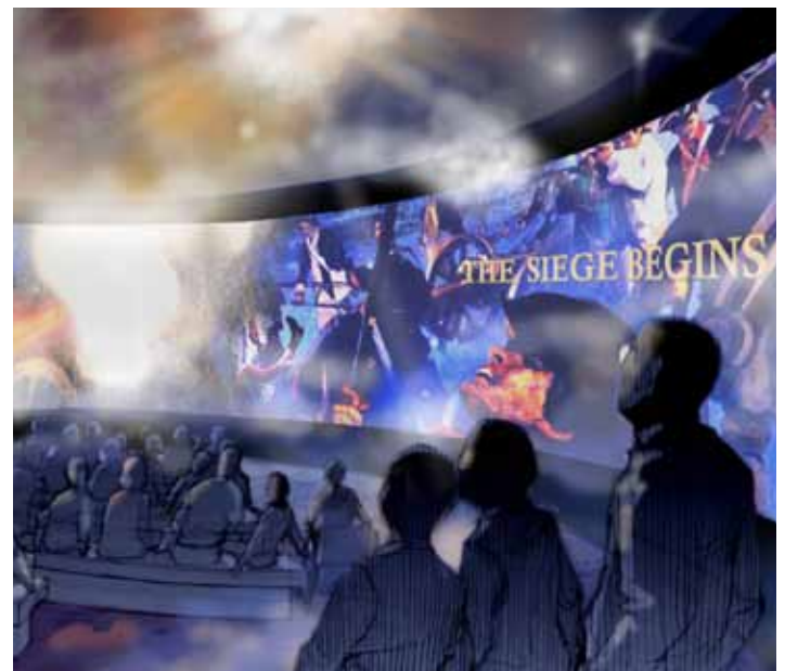
An experiential film in the new museum galleries will transport visitors to the battlefield at Yorktown in 1781. Private funds are supporting production of gallery films.