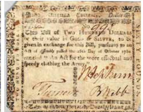
Shown are two examples of Virginia currency issued during the Revolution. An eight-dollar note issued in 1777 features the new state symbol, a figure representing Virtue with the motto SIC SEMPER TYRANNIS (thus always to tyrants), which was adopted by Virginia in 1776. A 1780 note was issued to fund clothing for Virginia troops.

Artifacts in the collection of the Jamestown-Yorktown Foundation.