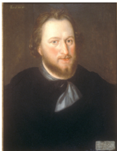
Thomas West, third Baron de la Warr, oil on panel, English, circa 1605. Jamestown-Yorktown Foundation, gift of the Gladys and Franklin Clark Foundation.

As the colony’s first governor the Company selected Sir Thomas West , third Baron de la Warr. West was a cousin of Queen Elizabeth I and a member of the Privy