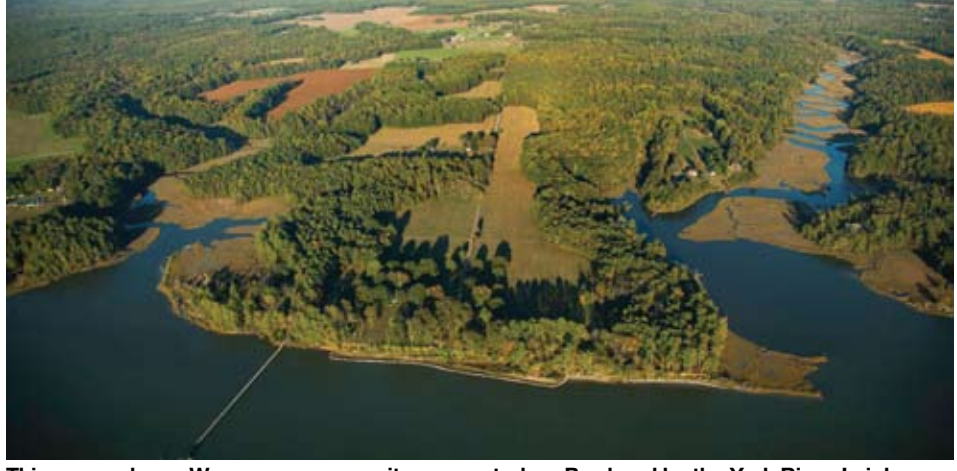
This scene shows Werowocomoco as it appears today. Bordered by the York River, Leigh Creek (left) and Bland Creek (right), the archaeological site is listed on the National Register of Historic Places and Virginia Landmarks Register.

Archaeological research since 2001 at Werowocomoco, on the York River in present-day Gloucester County, has revealed an intermittent