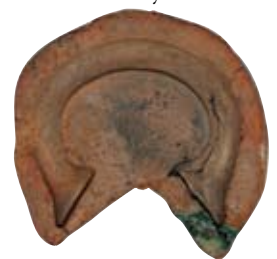
This manilla mold, recovered from the site of a 17th-century foundry in Exeter, England, was loaned by the Royal Albert Memorial Museum and Art Gallery for "The World of 1607" exhibition at Jamestown Settlement in 2007-08.

In 2007 the Jamestown-Yorktown Foundation mounted a major international exhibition called "The World of 1607" in honor of Jamestown's 400th anniversary. One of the items borrowed for this exhibition was an artifact recovered on the site of the Birdall foundry in Exeter, England, in 1984. This artifact, now in the collection of the Royal Albert Memorial Museum, appeared to be a mold for making manillas. The Birdall foundry where the mold was recovered went out